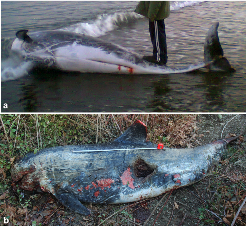
Figure 2. Stranded specimen of Risso's dolphin a) on the beach, 4 December 2012, b) on the disposed site, 13 December 2012