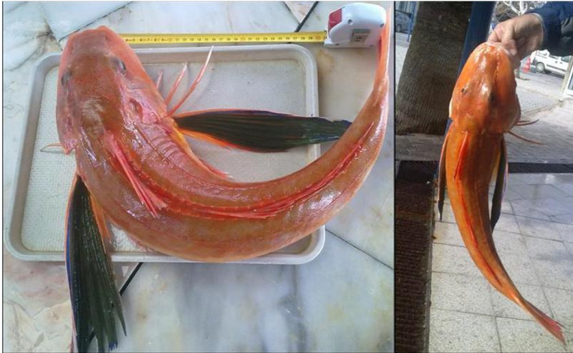
Figure 1. Chelidonichthys lucerna with 735 mm TL, caught from off Demircili, Sığacık Bay (Southern Aegean Sea)

Sea) at a depth of 90 m on a sandy bottom. Then, this fish was sold at a higher price in fish auction by Urla fishery cooperative.