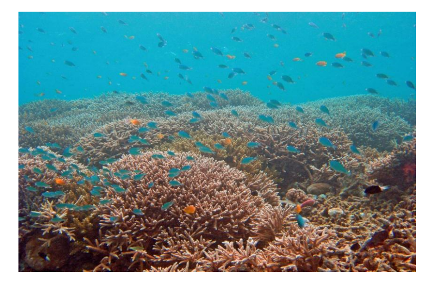
Figure 2. Coral reefs and zooxantella (Akajima Island).

Japan is one of few developed nations with coral reefs in their surrounding waters. The distribution of Japanese coral reefs is restricted mainly to the Ryukyu Islands (including Okinawa) and the Ogasawara Islands, both ranging between 24° N and 30° N. This range is the northern limit of the global coral reef distribution. Some hermatypic coral communities are distributed further north along the Pacific coast, up to the entrance of Tokyo Bay (35° N), owing to the influence of the warm Kuroshio Current (Figure 2). However, similar to coral reefs around the globe, the corals of Okinawa have been on the decline. Coral reefs around these populous islands have become particularly degraded during the last 40 years. In order to prevent the decline of coral reefs, it is imperative that the correct decisions are made, and the right actions are taken.