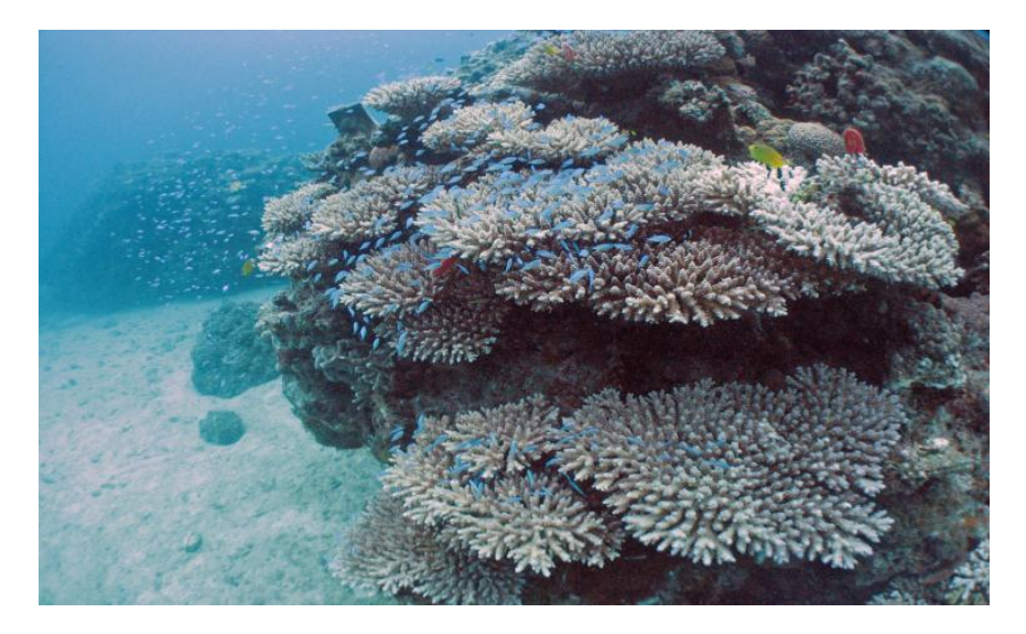
Figure 6. Acropora tenuis colonies that cultured from eggs and transplanted at Akajima Island.