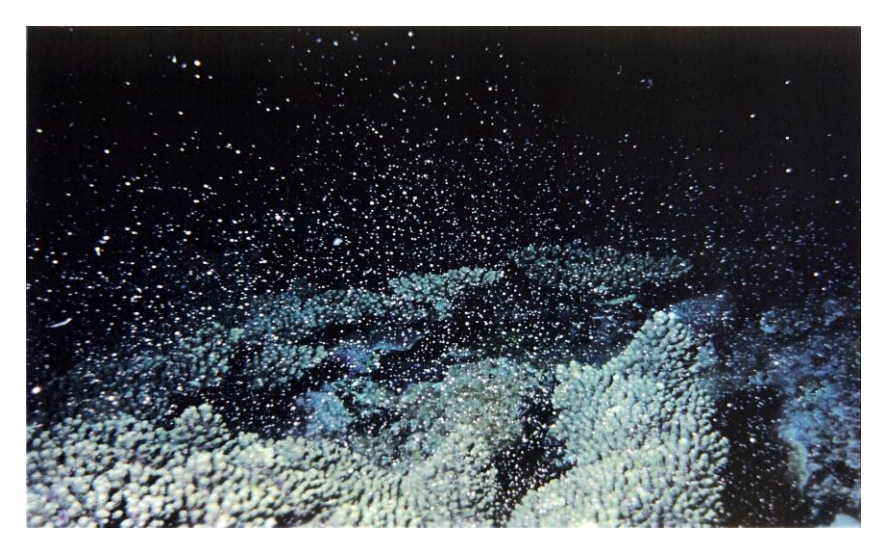
Figure 4. Mass spawning of hermatipic corals at Akajima Island.

the corals into the sea. Aggregates of fertilized coral eggs known as slicks, drift on the water surface following the mass spawning. In order to culture corals, the necessary eggs and embryos may be collected from such slicks. Alternatively, the corals are fertilized in the laboratory by gentle mixing of sperm/egg bundles collected from a number of donor colonies of the same species. The embryos are then bred in a large water tank on land or a floating pond in the sea, where they develop into planula larvae. Four to seven days later, the planulae swim down to the bottom in search for a suitable substratum to settle on.