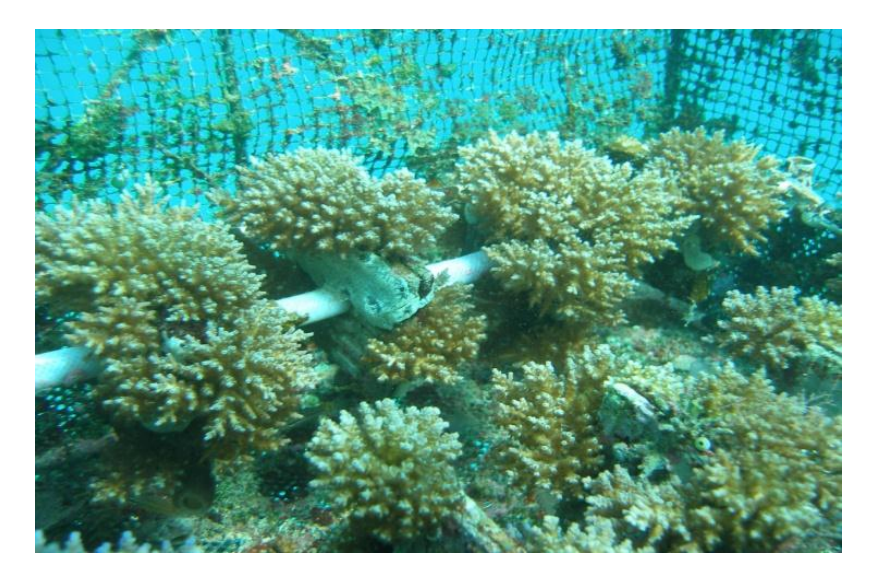
Figure 5. Eighteen month-old Acropora tenuis colonies in cage culture (Omori 2005).

mortality, algae-eating juvenile top-shell snail Trochus niloticus (Linneus) (5 to 10 mm in shell diameter) were grown together with the juvenile corals. This mixed culture of Acropora corals and juvenile top-shell snails in the same cage led to a dramatic reduction in coral mortality. In late 2006, 18 months after fertilization, colonies of Acropora tenius (Dana) grew to an average size of 6 cm in diameter (Figure 5). We transplanted 2,000 colonies onto the seabed off Akajima. In June 2009, some of these 4-year-old colonies, as well as 5-year-old ones, had grown to 20-25 cm in diameter and spawned for the first time, showing the possibility of using this technique to assist coral reef rehabilitation. Since then, the mass spawning of the transplanted corals has occurred every year. The colonies are over 30 cm in diameter and many fishes and crustaceans are living in and around the colonies (Figure 6). Furthermore, we were recently successful in producing a second generation of juvenile corals using the eggs and sperm obtained from the transplanted corals.