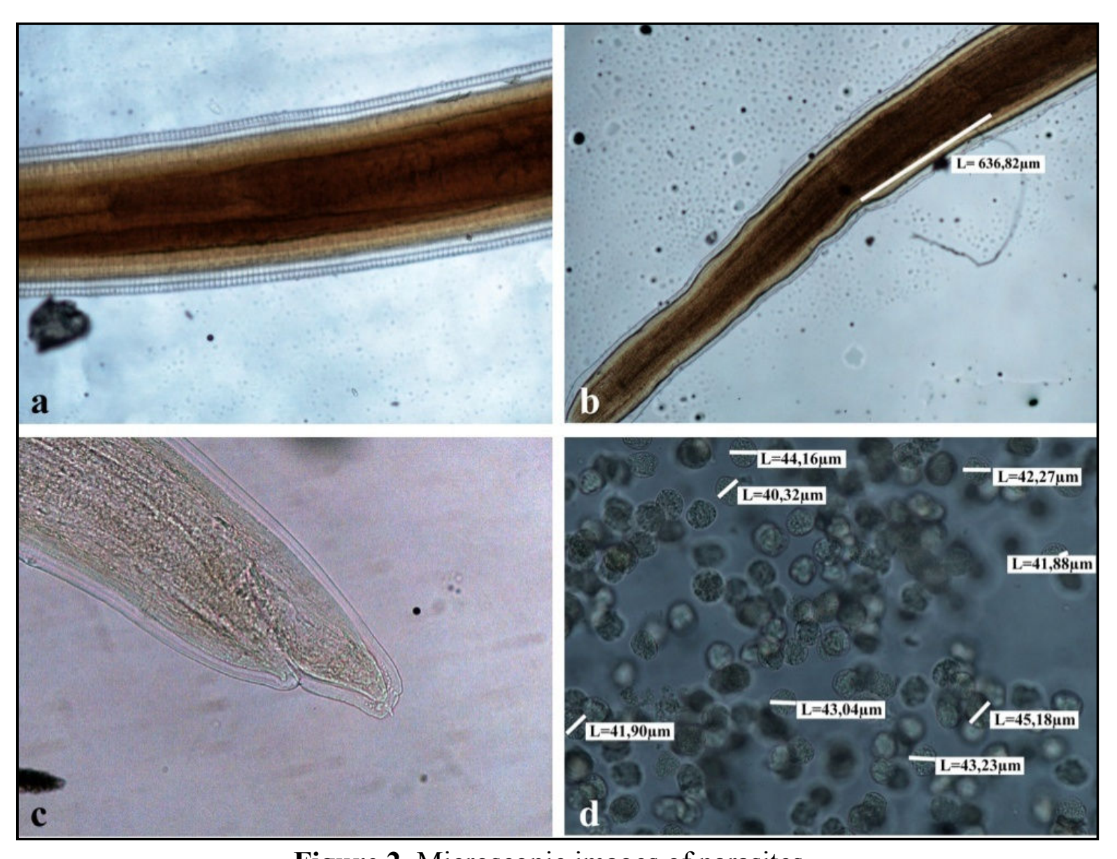
Figure 2. Microscopic images of parasites. a) Pseudoterranova sp. ventriculus b) Anisakis sp. ventriculus c) Anisakis sp. posterior d) Contraceacum spp. eggs

Even though we identified adult forms of Contraceacum spp., Anisakis spp. and Pseudoterranova spp. were seen mostly in larval form (Figure 2). Anisakis spp., which is a common species in the Mediterranean, was found in all stomachs.