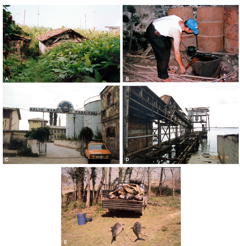
Figure 2. A) An old little hut still existing in one of the dolphin fishermen's garden. This old hut had been used for homemade production of dolphin oil until 1983. B) A farmer showed us how they produce oil from dolphin blubber with this old and handmade equipment before 1983. C) Entrance of EBK Factory in Trabzon. This plant has been unused since 1983. D) The port of entry to the plant from the sea. E) Bycaught harbour porpoises for processing in Yakakent in 1993.

Yakakent, after the 1970's, they stripped the skin of 150-200 dolphins in a day. They simply boiled blubber in pots to obtain oil. The processing of blubber of 30-40 individuals took a whole day. On the following day, they filtered the oil with cloth and obtained 2-3 barrels of oil from the boiler. The remaining portion was called 'kıkırdak (cartilage)'. They used it as fuel for thermo process and for a second process for oil. This 'black' oil was added to the first processed oil. In a season they sold 150-200 barrels (30-40 t) of oil.