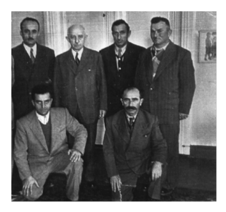
Figure 1. The Delagation of leaders of dolphin hunting (Karabacak Reis from Sürmene, Muzaffer Nuhoğlu from Akçaabat Mersin village and Mustafa Reis from Zavena (Salacık) (Malkoç), Prime Minister Hasan Saka and President of Turkey İsmet İnönü (Zengin 2011)

their request (Zengin 2011) (Figure 1). Turkey continued the cetacean fishery until 1983. Presently, all cetaceans are under the legal protection in the Turkish waters.