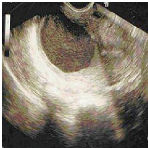
Figure 1. The ultrasonographic image of the adenomyotic cyst

echogenities on the right region of the corpus uteri (Figure 1). Magnetic resonance imaging of the patient revealed 52 × 46 mm lesion with internal fluid located in the myometrium on the right side of the corpus uteri. Adenomyotic cyst, cystic degeneration of intrauterine leiomyoma were firstly thought in the differential diagnosis and hysteroscopy and laparotomy were planned. Informed consent covering permission for documentation of the case was taken from the patient before the operation.