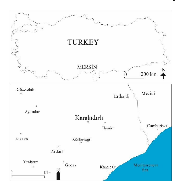
Figure 1. Location map of the study area