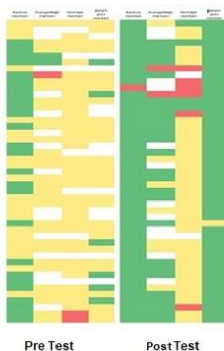
Figure 3. Mushroom awareness test Pre-test-post-test matrix.