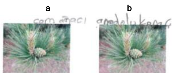
Picture 1. A sample of student answer

In the study, the illustrated plant-animal-mushroom awareness test was applied as pre-test and post-test. The answers given by the students were analyzed statistically. For true, partial and wrong answers 2, 1 and 0 points were ascribed in assessment of the study. In picture 1, the variation of the student answer as a pre-test and post-test were given where in the first answer (a), student just only state the class of the plant (black pine) and takes one point but in the post-test answer (b) also species type (Anatolian black pine) is given and take full point of two.