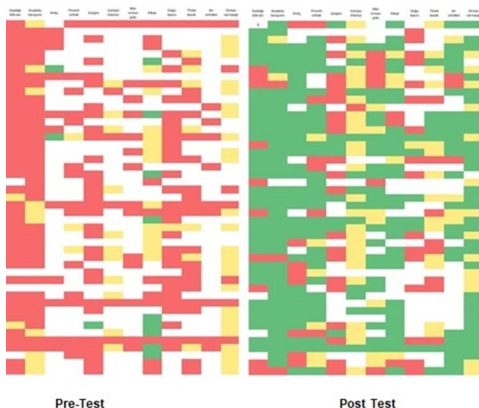
Figure 1. Plant awareness Pre-test-post-test matrix

When the answers given by the students were analyzed; the above matrix was created using green for exact answers, yellow for acceptable answers, red for incorrect answers, and white for blank answers. When the difference between pre-test and post-test is examined, white areas (blank answers) are on the decrease in the last test side. These students are hesitant to answer questions they do not know. When the change in redness (false answer) is examined, a marked decrease is seen.