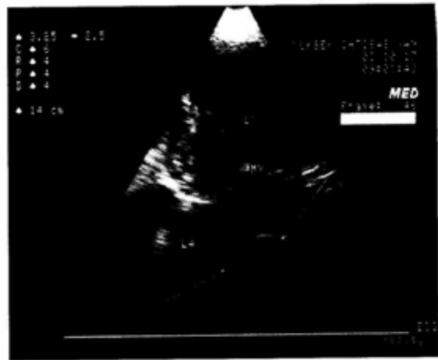
Fig 2: Transthoracic echocardiogram showing free floating thrombus filling the left atrium (LA).

We decided to take this case to operation urgently due to the fact that the giant left atrial thrombus was partially occluding the mitral orifice and the possibility of systemic embolization and also this thrombus might have been the origin of infection. Cardiopulmonary bypass was instituted by standard cannulation of the ascending aorta and bicaval with moderate systemic hypothermia. Through the left atriotomy, a fresh and huge mural thrombus was found to fill the entire left atrial cavity and was removed successfully. (Figure 3)