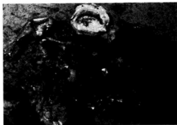
Fig 3: Operative photograph shows, giant mural and fresh left atrial thrombus with stenotic mitral valve after surgical removal approximately 7 x 8 cm in diameter.

We decided to take this case to operation urgently due to the fact that the giant left atrial thrombus was partially occluding the mitral orifice and the possibility of systemic embolization and also this thrombus might have been the origin of infection. Cardiopulmonary bypass was instituted by standard cannulation of the ascending aorta and bicaval with moderate systemic hypothermia. Through the left atriotomy, a fresh and huge mural thrombus was found to fill the entire left atrial cavity and was removed successfully. (Figure 3)