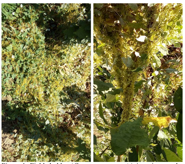
Figure 1. Field dodder ( Cuscuta campestris ) invasion on the weeds in apple (left) and cherry (right) orchard. Şekil 1. Elma ve kiraz bahçelerinde bulunan yabancı otlar üzerindeki tarla küskütü ( Cuscuta campestris ).

The degree of parasitic infection on the host plant and the prevalence was determined by a modification of the methods of Quasem (2008). The prevalence was determined based on the incidence of the same parasitic dodder on the same host in different infested locations. Prevalence of dodder was scaled rare, common and very common when the result was between 0-30%, 31-70%, 71-100% respectively. The severity of infection was rated as low, high and moderate depending on the intensity of parasite shoots on host plant and related plant damage (Quasem, 2008).