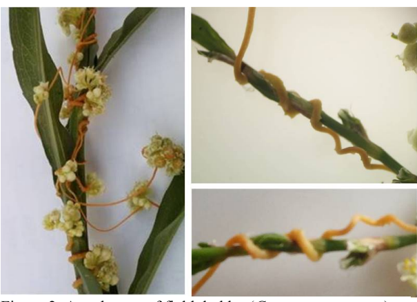
Figure 2. Attachment of field dodder (Cuscuta campestris) on host plant stem.

C. campetris has bisexual, self-fertile, sessile or short-pedicellate, white flowers with bell-shaped corolla about 2 mm long calyx. Calyx lobes are ovate-triangular, broad and overlapping. Styles are filiform; stamens are slightly exerted; anthers are elliptic, filaments slightly longer than anthers. Corolla tube is campanulate, corolla lobes are triangular-lanceolate, and stigmas are capitate. Inflorescence is 5-25 stalked flowers in clusters. Fruit is a capsule, indehiscent or irregularly dehiscent, depressed-globose to depressed, light-brown in color containing 2-4 seeds and seeds are oval, light-brown or brownish, to 1.2-2.0 mm long, 1-1.5 mm wide (Costea and Tardiff, 2006).