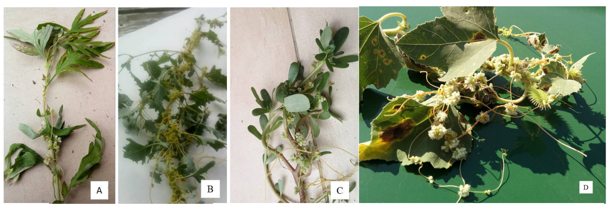
Figure 4. Field dodder (Cuscuta campestris) invasion on some weed hosts: A) Artemisia absinthium L.; B) Chenopodium album L.; C) Portulaca oleracea L.; D) Xanthium strumarium L.

Şekil 4. Tarla küskütü ( Cuscuta campestris )' nün bazı konukçu yabancı otları: A) Artemisia absinthium L.; B) Chenopodium album L.; C) Portulaca oleracea L.; D) Xanthium strumarium L.