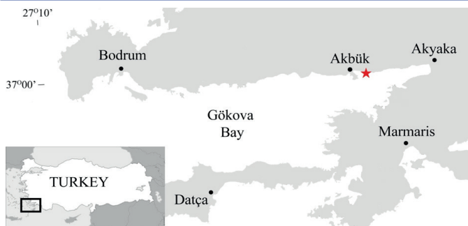
Figure 1. Sampling location of the maximum size Siganus rivulatus from Gökova Bay, southern Aegean Sea.

was collected by trammel net by a fisherman thus ethic committee approval was not required for the study. The biggest individual of S. rivulatus was caught off Akbük Bight (37°01.851'N, 028°08.669'E) (Gökova Bay) (Figure 1) at 15 m depth with trammel nets. The Total length of the specimen was subsequently measured to the nearest mm and weighted to the nearest g, where total length is expressed as the projection length between the front end of the fish head and the end point of the longest ray of the caudal fin when the mouth is closed in commercial fishery regulations of Turkey (communique no: 2016/35). Age estimation was based on otolith examination and supported with scale readings. Sagittal otoliths were removed and prepared for age readings by profiling, rubbing, and polishing. They were embedded in polyester molds and sections were obtained by cutting the mold with an IsoMet Low Speed Saw. Then, otoliths sections were polished with sandpaper (types 400, 800, and 1200) and with 3, 1, and 1/4 \mu particulate alumina respectively (Metin & Kinacigil, 2001). Age determination was carried out by a stereoscopic microscope under reflected light against a black background. Opaque and transparent rings were counted: 1 opaque zone, together with 1 transparent zone, was considered as the annual growth indicator.