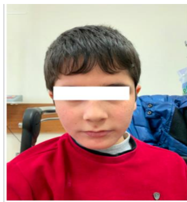
Figure 1a. Telangiectatic vessels in the face and a coarse facial appearance