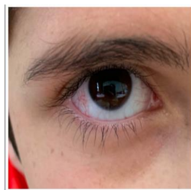
Figure 1b. Telangiectatic vessels in the sclera of Ataxia telangiectasia