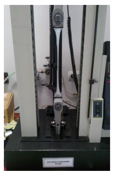
Figure 2. Elongation of aluminized aramid fabric

When look through the table, there are remarkable differences in the values. The reasons seem to be the types of weave and the fibers. Because meta-aramid fiber strength is inherently high. Cotton fabrics whose weave types were twill showed high strength values. Additionally, fiber strengths of cotton, wool, modacrylic and polyamide fibers are 0.45 N/tex, 0.11 N/tex, 0.27 N/tex and 0.29 N/tex, respectively. Course direction elongation of aluminized aramid was extremely high. This coated product was in warp knitted structure and the elongation extend can be seen in Figure 2. Three twill cotton fabrics have the lowest degrees of elongation because cotton fibers have lower elongation at break values than the other fibers [12-15].