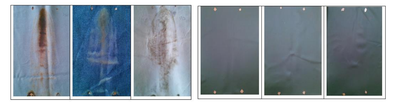
Figure 4. 350g - molten aluminium tested samples and related PVC skin simulant (from left to right: LenzingFR-Wool-Polyamide, Cotton 3-Denim, leather)