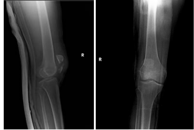
Figure2: Right patella fracture

A patellar fracture is one of the most common knee injuries, usually, after direct trauma to the knee. It represents nearly 1% of all fractures common in those ages between 20-50 years and males. (1-3) The coincidence of patellar fracture with femoral body fracture in the opposite leg is rather low frequency; moreover, it can be missed out unluckily (4). In this case, 24 years old young man is brought to the emergency department after a car accident. According to the patient's claim, he sat on the next seat of the driver without a seatbelt, and the car crashed to a truck from behind. The deformed, swollen, and painful left leg is