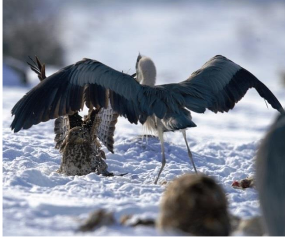
Figure 3. GH is attack to CB

The Red foxes, common ravens and brown bears showed the highest scavenging frequency in south-central Sweden [16]. According to the study in Poland, the most common avian scavengers were Eurasian jay ( Garrulus glandarius ), Raven ( Corvus corax ), Common buzzard ( Buteo buteo ) and the White-tailed Eagle ( Haliaeetus albicilla ) [17]. The Raven, Cinereous vulture, Griffon vulture, Eurasian magpie, Hooded crow, Starling, Long-legged Buzzard, dogs, Brown bear and Grey wolf are the most common vertebrate scavengers in this study.