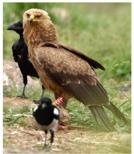
Figure 6. The Lesser spotted eagle with ring

[22]. An adult Lesser spotted eagle ( Clanga pomarina ) was observed and photographed with the Polish ring (J35) on June 6, 2014 (Figure 6). Two adult Griffon vulture were observed and photographed with Israeli ring(9V1 and X67) on June 7, 2015 in this study (Figure 7). The ringing and resighting data were shared through the Turkish National Ringing Scheme and researchers. Monitoring of scavenger birds with camera traps or cameras is also important in terms of ringed bird feedback.