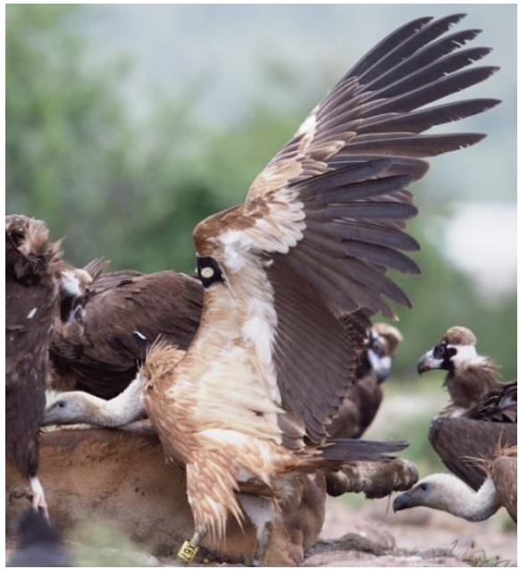
Figure 7. The Griffon vulture with ring

The Vulture Restaurant placed around rocks and logs have become the roost place for monitoring. The number of Cinereous Vultures in the field can reach up to 52 individuals simultaneously [23]. Their numbers reached up to 40 individuals in this study. They were observed in every season of the year.