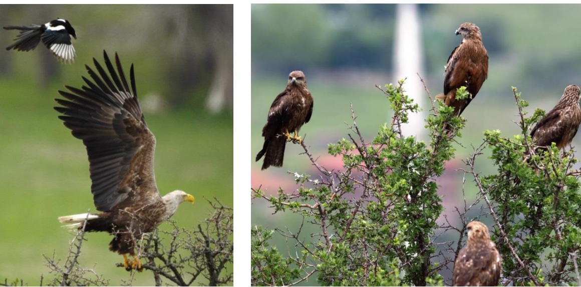
Figure 4. W. tailed eagle & E. magpie

High trees are important for the roost of raptor species [13]. High trees are important for roosting and resting of raptor species (Eastern imperial eagle, Hooded crow, White-tailed Eagle (Figure 4), Long-legged Buzzard and Black kite (Figure 5)) here. After the feeding/scavenging behaviour, some birds perch on the top of a tree and rest. So their high-level trees are important for raptors here. Fox showed removing behaviour but the grey wolf and some raptors (Golden eagle and Eastern imperial eagle, Cinereous vulture) showed two different behaviour together; both eating and removing on carcasses. They may have removed these foods for their offspring.