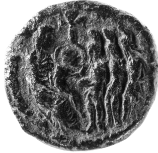
Fig. 3 Terracotta pilgrim's token ( http://www.britishmuseum.org/research/collection_online/collection_object_details.aspx?objectId=62931&partId=1 , Access date: 30.12.2013).