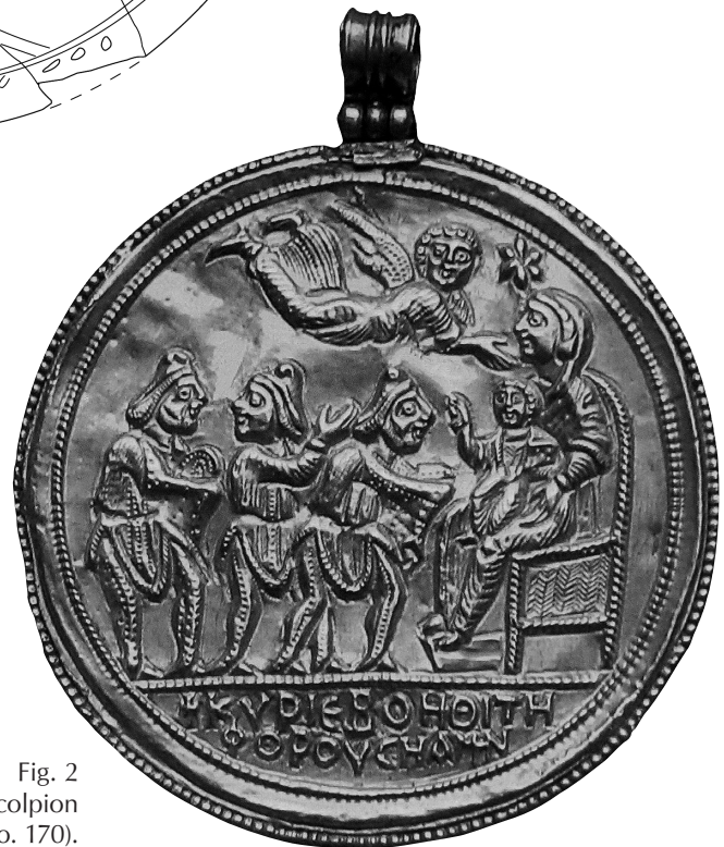
Fig. 2 Gold encolpion (Entwistle 1990, cat. no. 170).