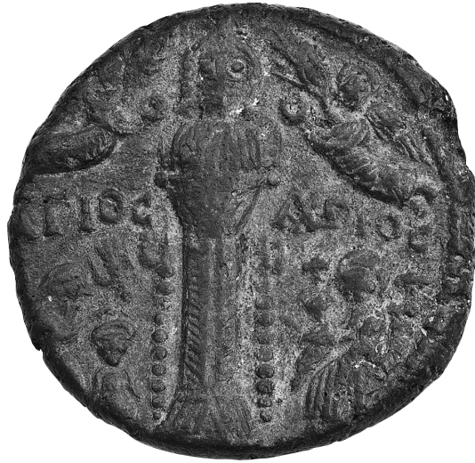
Fig. 4 Terracotta pilgrim's token ( http://www.metmuseum.org/exhibitions/view?exhibitionId=%7b60853040-AE7E-4162-8FA7-525505D6B633%7d&oid=477460&pg=1&rpp=100&pos=73&ft=* , Access date: 30.12.2013).