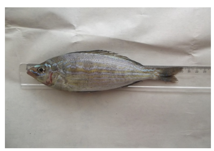
Figure 2. The blotched picarel with 20.3 cm in total length and 159.00 g in total weight

The blotched picarel obtained from Saros Bay was 20.3 cm in total length and 159.00 g in total weight (Figure 2). The comparison of the maximum lengths and weights Spicara maena for Northern Aegean coasts of Turkey is given in Table 1.