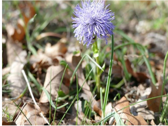
Globularia trichosantha subsp. trichosantha