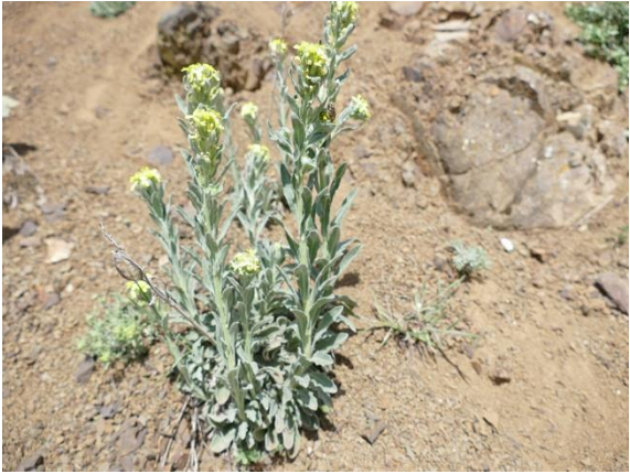
Fibigia clypeata subsp. clypeata var. eriocarpa