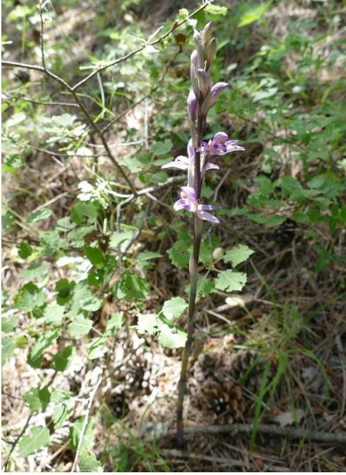
Limodorum abortivum var. abortivum