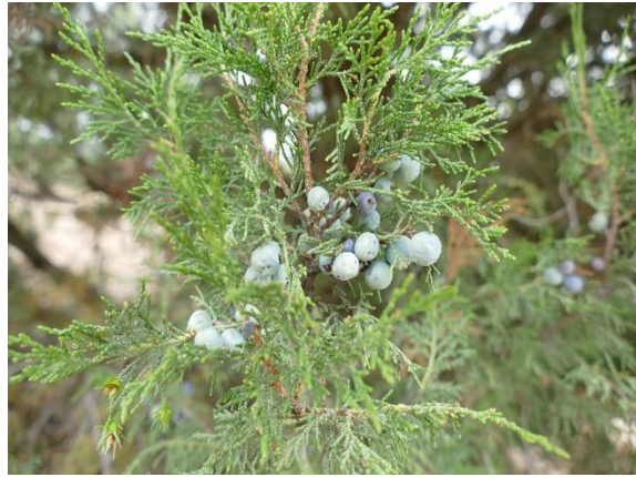
Juniperus excelsa subsp. excelsa