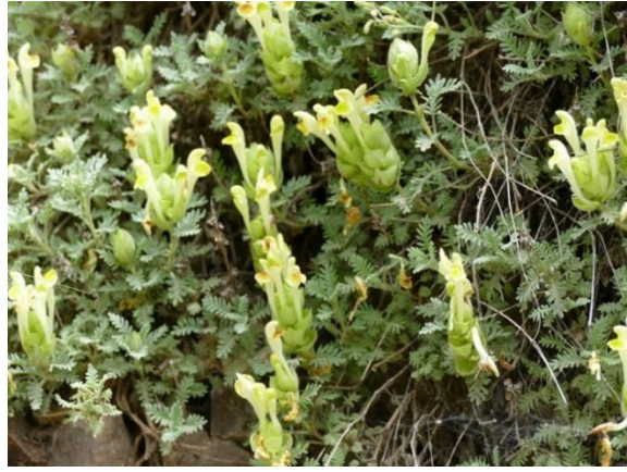
Scutellaria orientalis subsp. pinnatifida