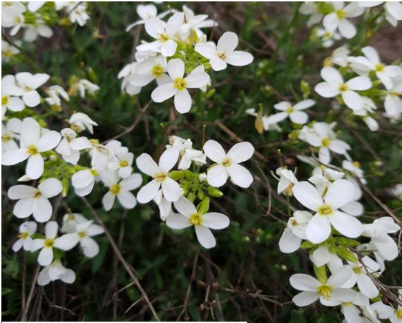
Arabis alpina subsp. alpina