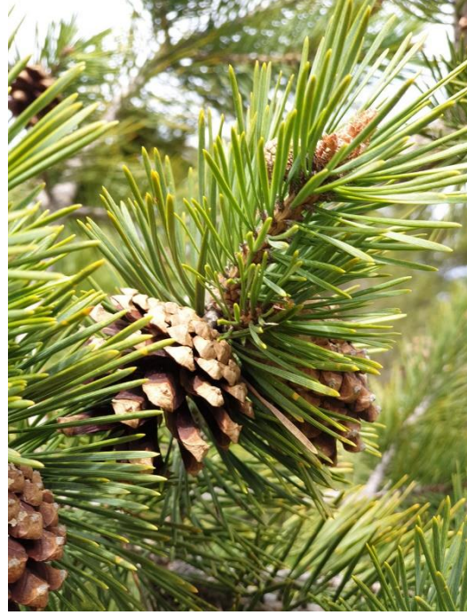
Pinus sylvestris var. hamata