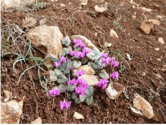
Cyclamen coum subsp. coum