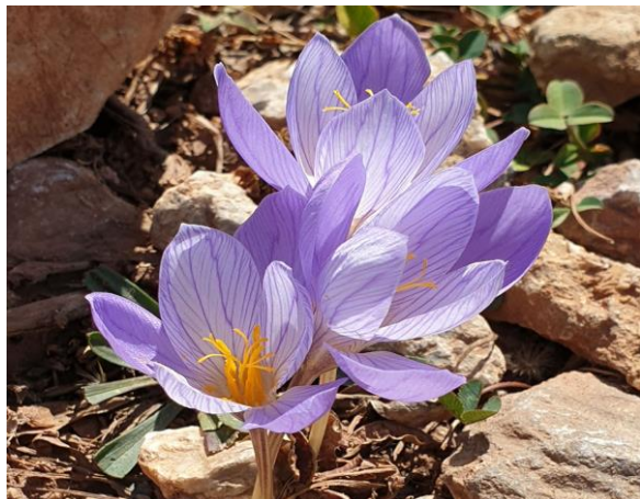
Crocus speciosus subsp. ilgazensis