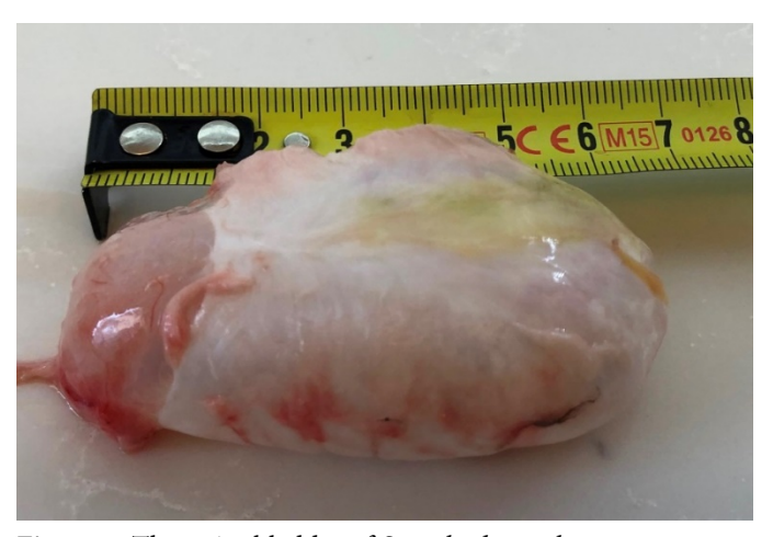
Figure 3. The swim bladder of Symphodus melops