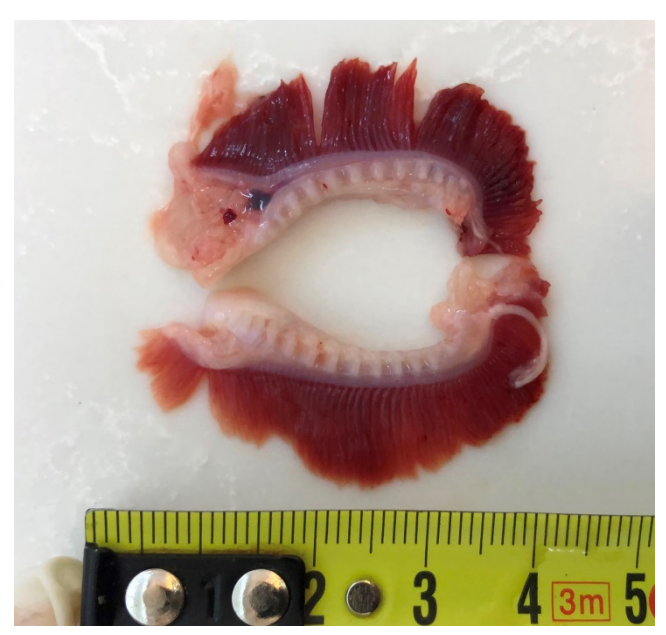
Figure 4. The first gill arch of Symphodus melops