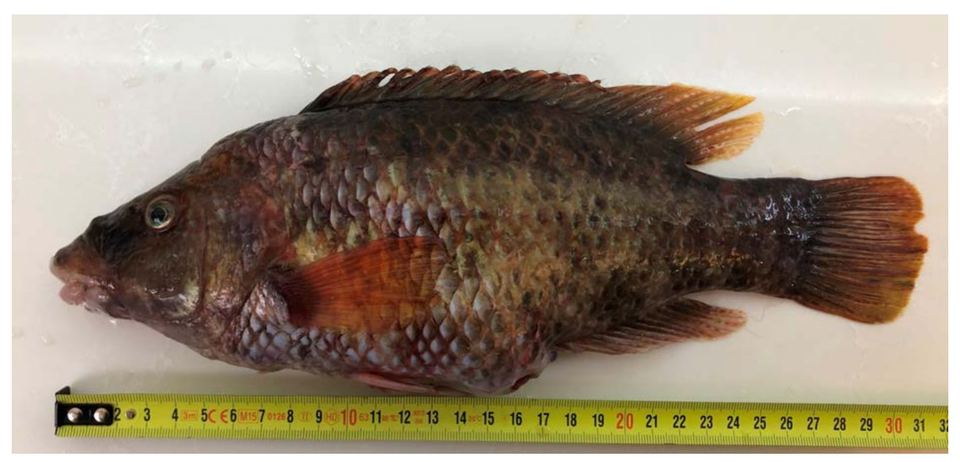
Figure 1. Symphodus melops 320 mm total length and 520 g weight from the Black Sea

Seven meristic characters were examined. The lists of meristic characters used for the analysis of S. melops are presented in Table 2.