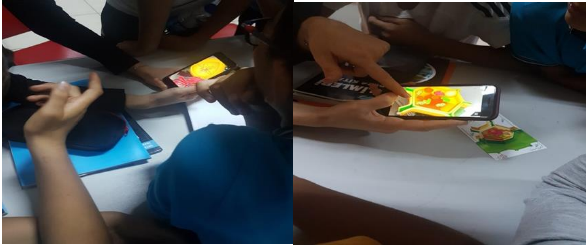
Figure 3. Examples showing students' interest in AR implementation

Student A: ...I wish we used augmented reality applications in our new subjects, the lesson was very enjoyable.