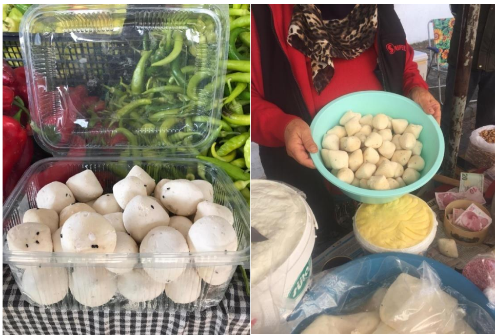
Figure 1. Katık Keş sold in Bolu local bazaars

immediately after production, or sometimes marketed after a long wait from production, or the production style habit. The values obtained were similar to the values reported by Akyüz et al. (1993). In addition, the results were lower compared with the values obtained by Güven and Karaca (2009).