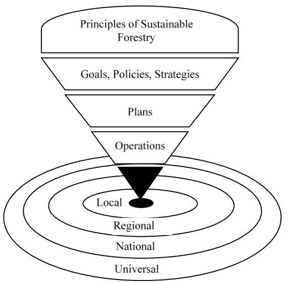
Figure 3. Decisions and their propagation in the forestry applications

human factor to the implementation of these decisions is a difficult task. As a matter of fact, in recent years, many forest workers/operators have been given technical and occupational health and safety trainings within the framework of national professional qualifications. Thus, will be possible to provide people-oriented it improvements in the near future in terms of enforcing the decisions taken at the upper and middle level decision processes. As with the approach developed by Alkan and Eker (2005) as the spinner model (Figure 3), the conversion of all kinds of objectives, policies and strategies and tactics related to forestry operation depends on the person living in the forest and working at the same time. Human beings are the practitioners as operator and worker of all technical, economic and environmental decisions in forest, stand, and tree scale. People's perception, expectation, attitude and behavior are a vital factor in this regard. However, people's employment and high income expectations show that they are ahead of environmental sensitivity.