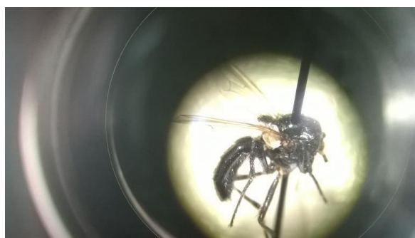
Figure 4. General view of Hydrotaea capensis

It is a cosmopolitan species with a dark metallic gloss and greenish blue color, about 4 - 5.5 mm in length. The palp and antenna are black, calyptas are white or yellowish, the frontal triangle extends to the middle of the forehead and the posterior tibia is slightly curved [14].