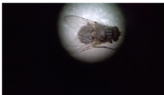
Figure 3. General view of Musca domestica

Musca domestica Linnaeus 1758, (Housefly), is cosmopolitan, one of the closest living species of diptera. In general, they spread around 3 km of the areas where people are settled. It is not much away from this kind of person and therefore from the dwellings. After garbage, carrion and feces, they cause great trouble because they haunt human food. It is the vector of many pathogens. Adult and larvae prefer stools and spoiled herbal materials. Adults are also attracted by meat and sweet foods, and their larvae can develop sufficiently in these materials [11]. Depending on the temperature, the population reaches its maximum in late Spring and Summer. The rarity of this species on fresh corpse is due to the absence of excrement or intestinal contents [12]. Since they carry a wide variety of disease microbes in their bodies, they infect everything they travel. Because they leave feces to places they visit every 5 minutes. Cholera infects diseases such as diarrhea, dysentery, hepatitis, polio, food poisoning, salmonellosis, tuberculosis [13].