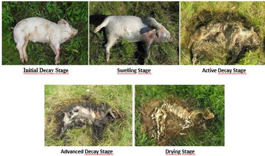
Figure 1. Decay stages