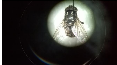
Figure 5. General view of Stomoxys calcitrans

also called barn flies, have a wide host variety, rats, guinea pigs, rabbits, monkeys, horses, camels, goats, pelicans and cattle make up their original mansions. Although these flies lead a very active life, they are especially problematic in farms. In addition, they are very important due to their potential to be seen in the settlement areas and beaches close to agricultural production. Severe insertion activities of Stomoxys flies can cause serious problems resulting in milk production and live weight loss. It has been reported to cause losses of 19% in live weight and 40-60% in milk yield [15].