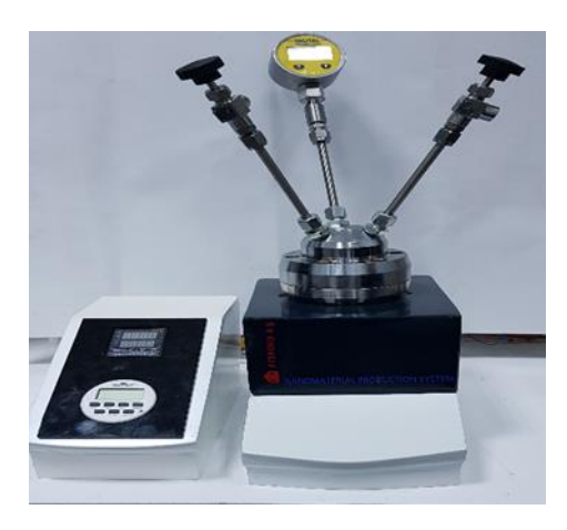
Figure 1. FYTRONIX nanomaterial production device

Nano structured TiO2 powders were synthesized using FYRTONIX nanomaterial production system, as shown in Fig. (1). Chemical precipitation method was used for the production of the powder sample. In this method, 12 ml of titanium (IV) isoproxide was taken and dissolved in 10 ml of isopropanol. Then 150 ml of de-ionized water and 5 ml of citric acid were added to this mixture and stirred at 80 °C at 1000 rpm for 4 hours. In the event of coagulation, concentrated citric acid (1:10 citric acid-water solution) was kept ready and 1 ml was added to the mixture where necessary. After 4 hours, a viscous solution was obtained, and after drying the solution at 100 ° C for 10 hours, the resulting precipitate was roasted at 450 ° C for 2 hours. The poasted precipitate pulverized by grinding in a mortar.