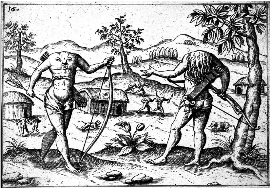
Figure 2: Depiction of Blemmyes, engraving in a 1603 German edition of Sir Walter Raleigh's "Discovery of Guiana," 1595.