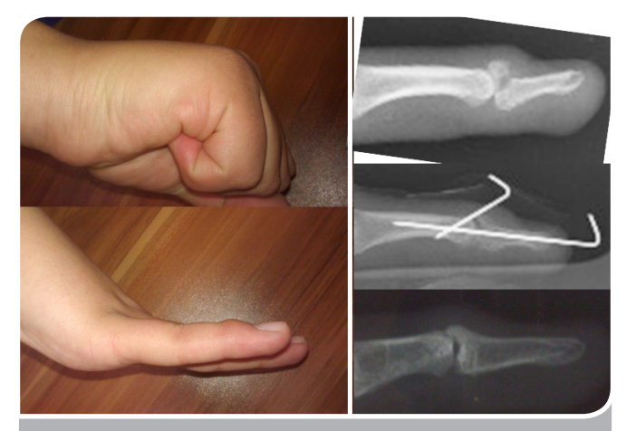
Figure 3: Postoperative 24 mouth clinical control picture, preoperative, early postoperative and postoperative 24 mounth radiographies. The avarage articular surface involvement was 60%. There was no limitation of DIP joint motion.

An untreated mallet injury is painful. The swan-neck deformity develops due to compensatory hyperextension at the PIP joint of the finger (6, 7). The oseous mallet finger constitutes about 5 - 10 % of mallet finger injuries (8).