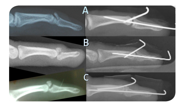
Figure 1-A: The avarage articular surface involvement was 30%. Figure 1-B: The avarage articular surface involvement was 50% and DIP joint subluxation was seen.

Mean age of the pre-operative patients were 29,8 (range 18 to 42) and 29 of 36 patients (80,5 %) were male and 7 (19,5 %) were female. The 4th and 5th fingers were the most frequently involved finger<sup>12</sup>, followed by the 1st fingers<sup>5</sup>, the 2nd fingers<sup>4</sup> and the 3th fingers<sup>3</sup>. 27 patients had mallet injury in dominant hand, 9 patients had in non-dominant hand. Based on the Doyle classification, 25 injuries were classified type IVb, 11 injuries were classified type IVc (Figure 1).