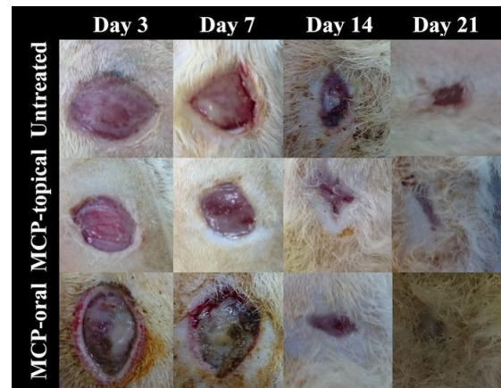
Figure 1. Macroscopy images of wounds in rats

Wound macroscopy. Mild erythema was observed on the wound edges in the untreated rats and the topical MCP rats on day 3. On day 7, a thin layer of tissue was observed at the base of the wound in both MCP groups. Wound contraction on day 14 was recorded to be highest in the MCP-orally treated wounds, followed by the MCP-topically and untreated wounds. On day 21, the highest wound contraction was noted in the topical MCP group (see figure 1).