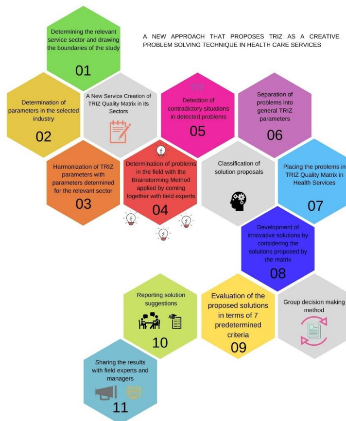
Figure 3: Implementation Steps of the Study

This study was designed based on the question of how TRIZ method, which is frequently used in other sectors and has very beneficial results, can be used in health services. The final result we want to achieve is to propose a unique methodology and to develop a matrix suitable for use in the service industry. While doing this, efforts have been made to catch the method that TRIZ followed in the beginning. Our limit condition here is that we do not have too many problems. In this process, group decision-making methods and creative thinking techniques were used in appropriate places within our framework. The methodology that has emerged and suggested accordingly is given in Figure-3 below. Our work, which tries to identify the problems experienced in health services and to offer creative solutions to the detected problems, consists of 11 steps. While determining these steps, the methods in a case study conducted in 2008 to improve the quality of the e-commerce company were reviewed for improvement (Su, Lin and Chiang, 2008).