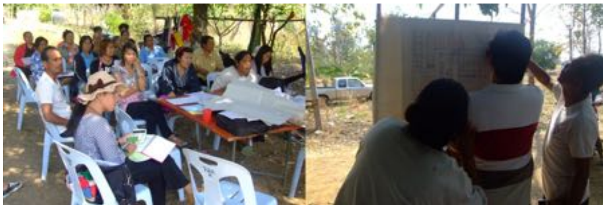
Figure 2. Left: people participate in the meeting and workshop to design the housing layout concentrating on sharing equal plot of lands and readjustment. Right: people draw lines to reveal plot of lands and maximum possible house size. The agreement is to build 17 twin houses and 9 detached houses for new occupants, and to upgrade 13 houses for the original dwellers.