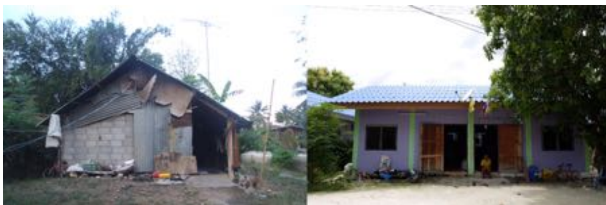
Figure 3. The change of a house of a squatter who joined the project in 2010. In 2012, he demolished the old house (left) built from bricks and galvanized iron sheets, and he built a new twin house (right) for himself and his daughter.

Both new and old residents selected land sharing and readjustment to create a brand-new community with more efficient layout of plots. The negotiation between them took time, as some original households complained that their plots are smaller than they had initially. However, the participatory planning and design processes were stages of negotiation to achieve consensus to provide similar plot sizes of around 30 square metres with secure tenure.