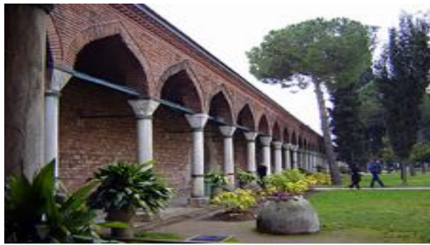
Figure 13. Portico

There is also some small courtyards in the Harem where reaches through this courtyard. According to the tradition, the Harem is a collection of buildings which is enclosed, covering their own outdoor spaces and Safa gardens. The most important of the Harem courtyards are, Queen Mother Courtyard, The Courtyard Favorite Wives of the Sultan and Courtyard of the Princes (Figure 16).