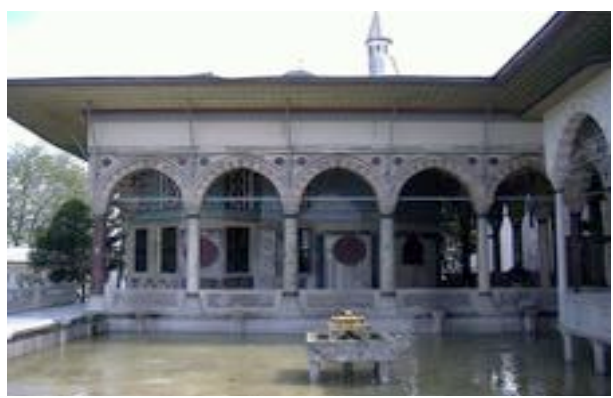
Figure 21. Revan Pavilion

The Fourth Courtyard also known as the Imperial Sofa ( Sofa-ı Hümâyûn ). This was the private garden of the Sultan in which there are many pavilions. All of these pavilions, which are famous for their internal decoration, are open for visiting as Palace buildings (Figure 21).