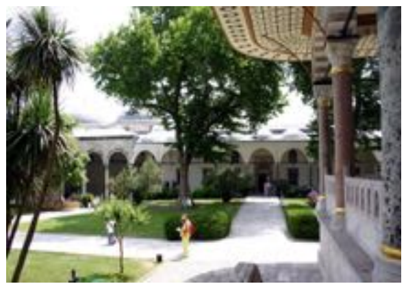
Figure 18. Enderûn Library, Or Library Of Sultan Ahmed III

The Third Courtyard which has the private parts of the palace within the gate of "Bâbi Saadet". It is a smaller perystyle than the second court. This court is surrounded with the important buildings of the palace as Harem, the Treasury and Supply Room. At the same time, the third court was a university where the precious artists and scholars of the palace lived and worked. It was called Enderun (Figure 18). The entry of Harem is from this court (Mutlu, 2006).