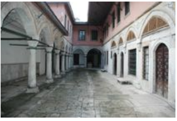
Figure 20. Courtyard Of The Concubines