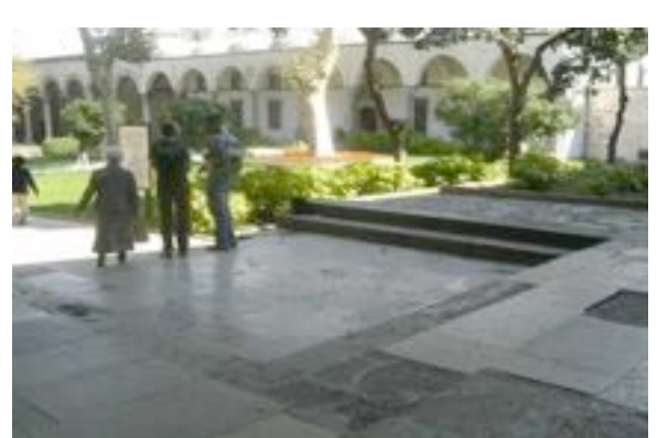
Figure 17. Marble Floor—Atrium