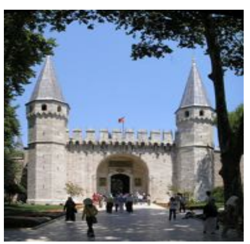
Figure 7 and 8. The Second Gate Of The Palace (Babüsselam)