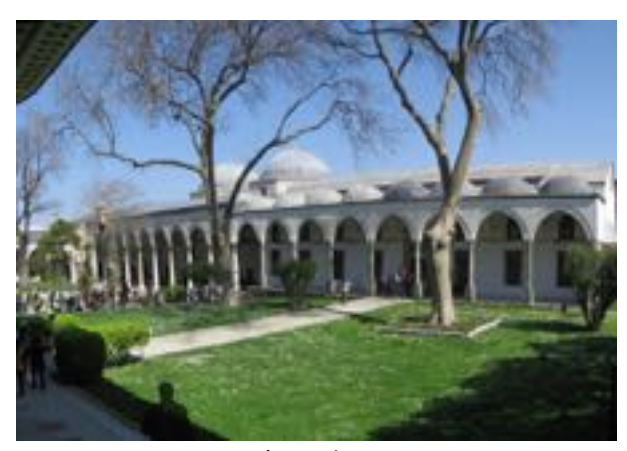
Figure 9. Conqueror's Pavilion

The courtyard is encircled by a portico. The ground tilted towards the center is paved with stone (Figure 13).