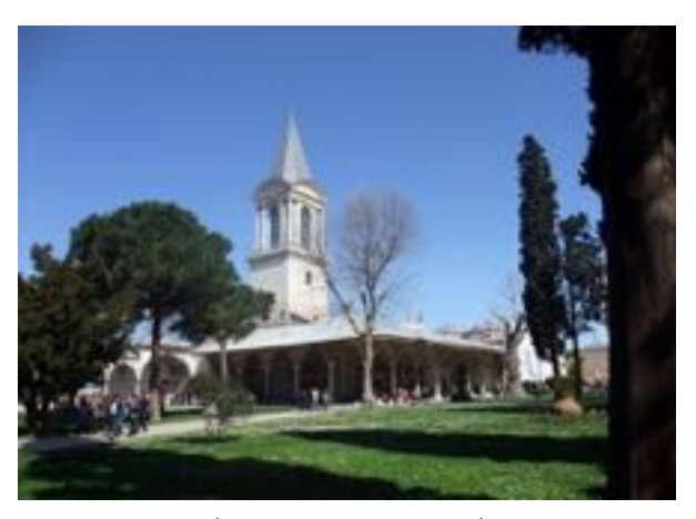
Figure 10 and 11. Divan Square And Cypresses Trees