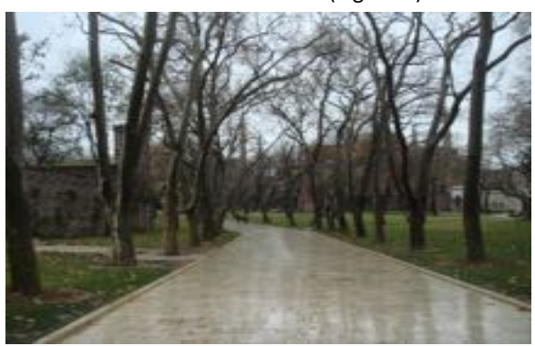
Figure 5. A Long The Path Of First Courtyard

There are platanus trees, some of which is 400 year-old in this courtyard. The body of one of the platanus tree is 14 meters around in the court (Figure 6).