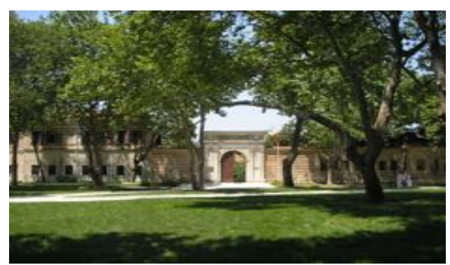
Figure 2. First Courtyard Of The Palace

In this courtyard; warehouses, structures for guards and services were located. Also it was the place for courtiers to ride horses. The first courtyard, which is the transition place between the inside and outside of the palace, has shrunk with new structures that have been added to the courtyard over time. Trees are the only plant elements that are remained along the way which associate the two entryways (Figure 2).