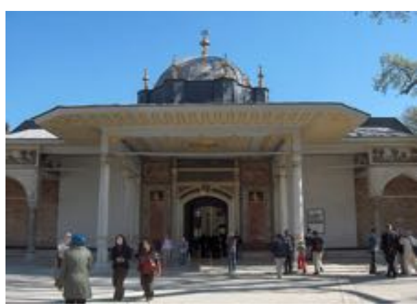
Figure 14. The Last Main Gate (Babüssaade)