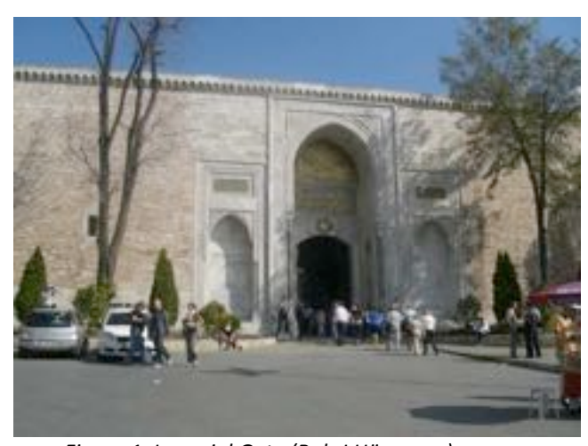
Figure 1. Imperial Gate (Bab-I Hümayun)

In this courtyard; warehouses, structures for guards and services were located. Also it was the place for courtiers to ride horses. The first courtyard, which is the transition place between the inside and outside of the palace, has shrunk with new structures that have been added to the courtyard over time. Trees are the only plant elements that are remained along the way which associate the two entryways (Figure 2).