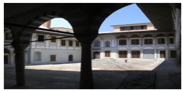
Figure 16. Queen Mother Courtyard