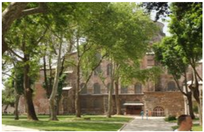
Figure 3 and 4. Church Of Hagia Eirene in the First Courtyard