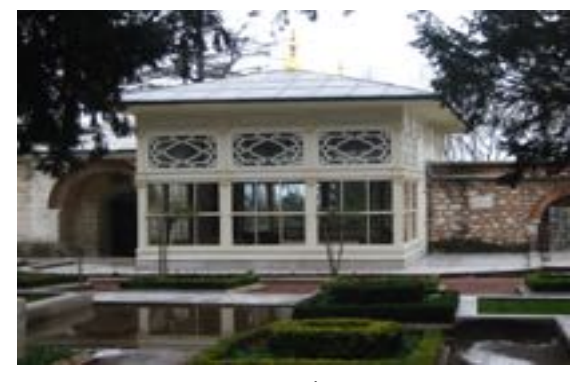
Figure 22. Tulip Garden