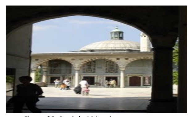
Figure 25. Baghdad Mansion

While Hasbahçe was generally known as the sultan's private garden, Topkapı Hasbahçe had also art and science education buildings. It was the arts and sciences academy of that period. Here, artists such as Mimar Sinan and Mimar Mehmet were educated.