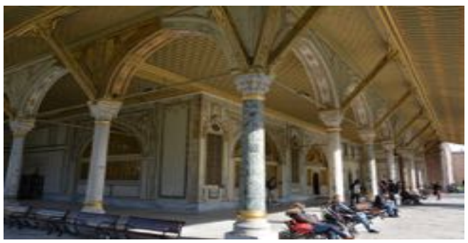
Figure 12. Kubbealtı