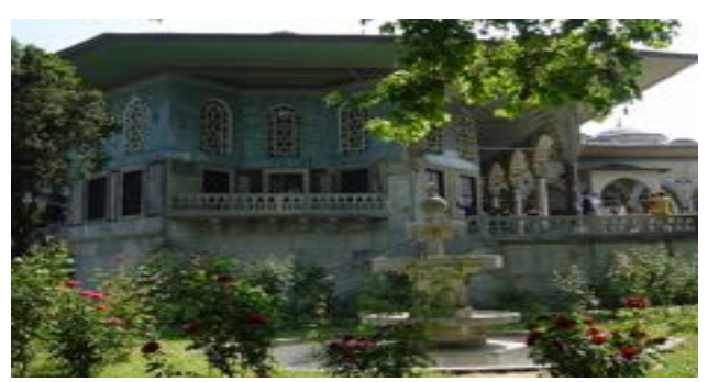
Figure 24. The Revan Mansion

In the gardens, at the beginning of the fourth yard, there are Baghdad and Revan Pavilions, built with inspiration at the wartime of Baghdad of Sultan Mehmed. The terrace, surrounded by Baghdad, Revan and Sünnet Pavilions, is one of the most beautiful outdoor space of the collection of the palaces. The use of marble for flooring, fountains and bars by the seaward, gives unity to the expression of the space (Figure 24). The Revan Kiosk served as a religious retreat of 40 days. It is a small pavilion with a central dome and three apses for sofas and textiles.