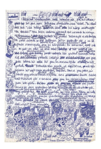
Figure 4 and 5: The Black Book sketches by Orhan Pamuk (Milliyet, 2015) (The Paris Review, 2005)