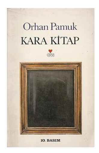
Figure 1 and 2: The Black Book Book Covers

Pamuk reveals his postmodern view in the story as the book carries the main characteristics and follows the principles of postmodernist literature (Yaprak, 2012). The book tells a story before the military coup in 1980s. Even mysterious characters about military coup are mentioned in the novel. Due to the environment, Istanbul is being transformed. However, as a postmodernist writer, Pamuk has seen previous periods of Istanbul so he reflects his feelings that Istanbul should not been changed. Finally, according to Bernt Brendemoen (n. d.) , there are many nested themes in The Black Book.