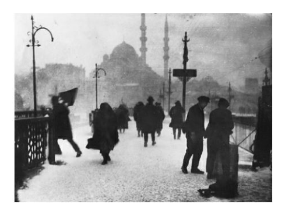
Figure 3: Image from Istanbul: Memories and the City (Pamuk, 2003)