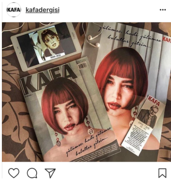
Figure 1. The repost of a reader by Instagram account of Kafa Dergisi, with famous Turkish pop singer Sezen Aksu cover and a youtube video one of her song on phone.