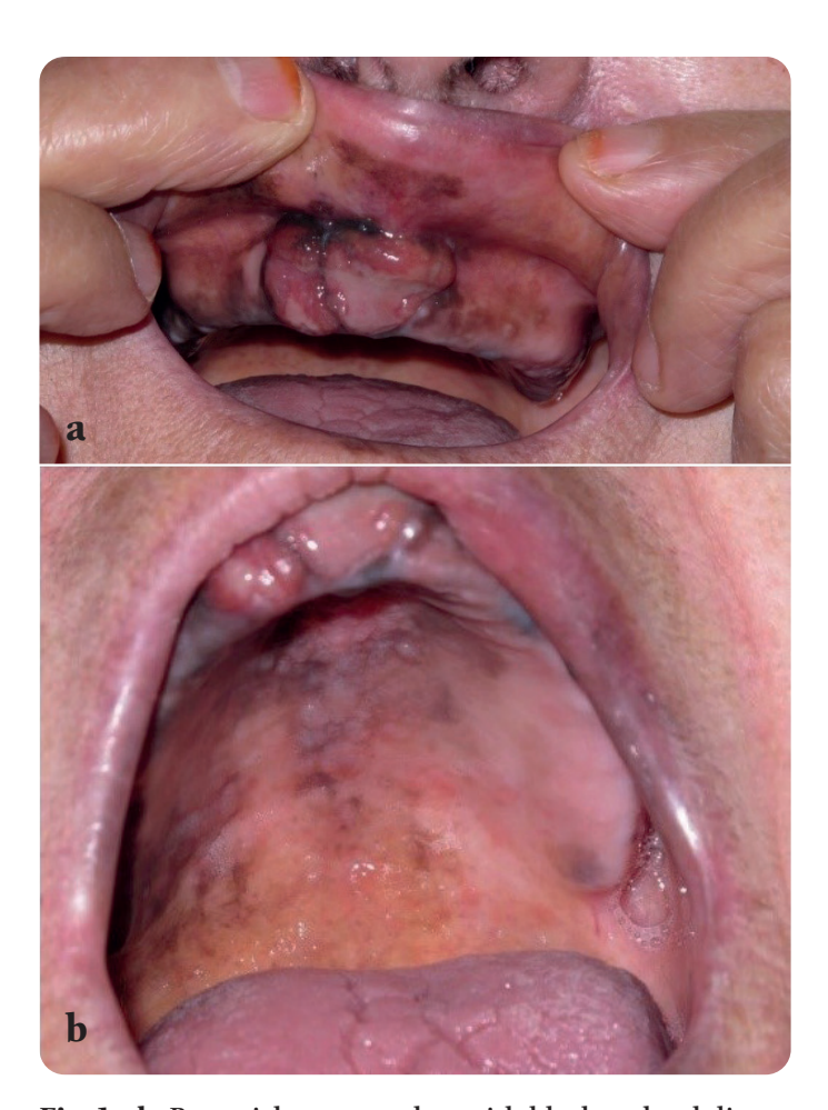
Fig. 1a-b. Brownish-gray patches with black and red discolorations and tumoral mass of the malignant melanoma in the upper gyngival region of the patient

A seventy-nine-year-old female patient applied to the department of dermatology with a complaint of the rapidly growing asymptomatic mass in gingiva for one month. Dermatological examination showed brownishgray patches with black and red discolorations, starting from the vestibular mucosa of the right maxillary gingiva and extending to the left maxillary gingiva, settling in the hard palate and upper lip mucosa. Painless and soft consistency pink tumoral lesion was observed on palpation (Fig. 1a-b). A solitary submandibular lymph node was also palpable in the right side about 2x2 cm in size, which was freely mobile. Complete blood cell count and biochemistry results were within normal limits. For a confirmatory diagnosis, an incisional biopsy was performed under local anesthesia. Histopathological examination revealed infiltration of