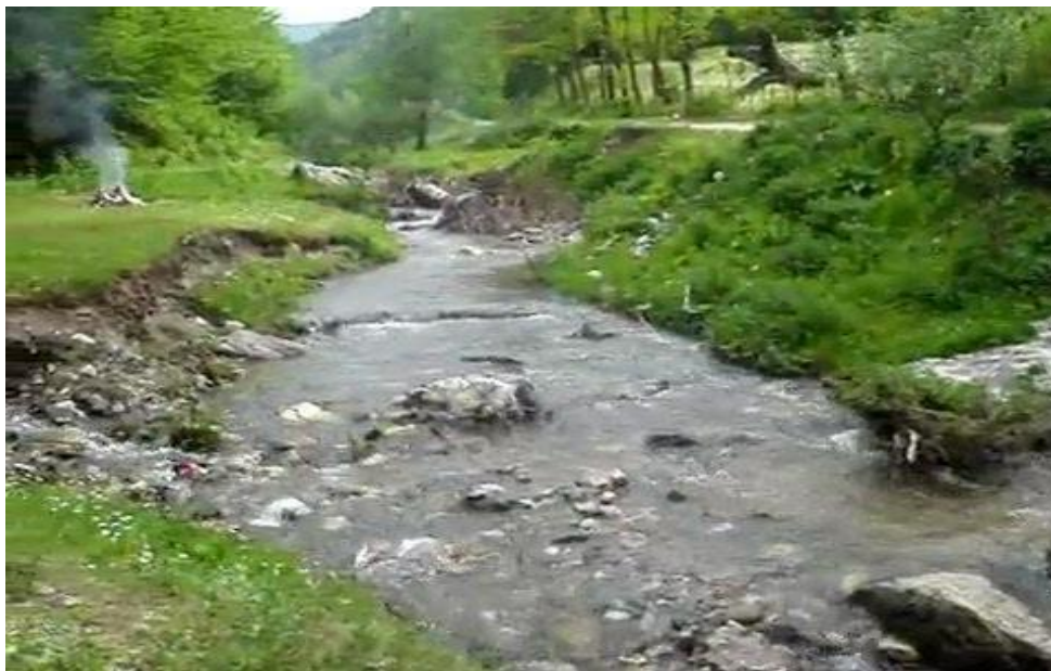
Figure 1. A view from Nerodime River in Kosova

Although with the poor flow, river Nerodime has an important hydrographic role due to the bifurcation phenomenon its two tributaries form. One tributary of the river flows into river Sitnica (Black Sea basin) and the second one into the river Lepenc ( Aegean Sea basin) (Kosova Environmental Protection Agency (2008–2009).