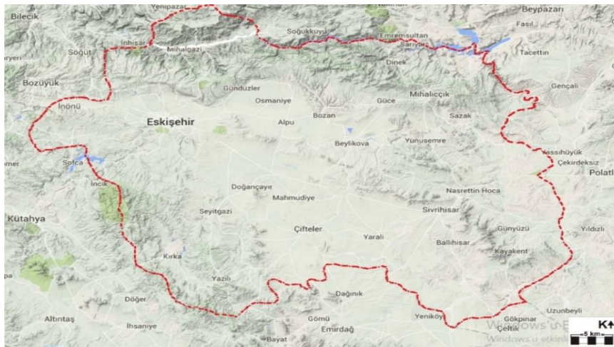
Figure 2. Study area map

This study was conducted to emphasize the importance of edaphic and geological isolation in terms of floristic diversity and endemism. Some of the important reasons of floristic diversity of Turkey are the intense endemism that develops from edaphic and geological rocks; and is explained by the term “geological island”; and such areas are called “geological island” or “edaphic island”. The main factors affecting the diversity of the species in the areas where gypsophila live are electrical conductivity, soil pH and soil anion and cation concentrations (Smith, H. W., & Weldon, M. D., 1941). These factors also determine the degree of influence of the biotic factors (Akman et al., 2014). In the context of the study, gypsiferous soils in Eskişehir and the vegetation cover, species diversity and ecological effects were determined (Türe, C. 2000). In the present study, the aim is to complete the lack of literature data on gypsiferous soils and plant cover in Eskişehir. It has been determined that some local floristic studies have been conducted around the study area (Özaydın and Yücel, 2004; Umay and Uğurlu, 2010; Özgişi et al., 2015).