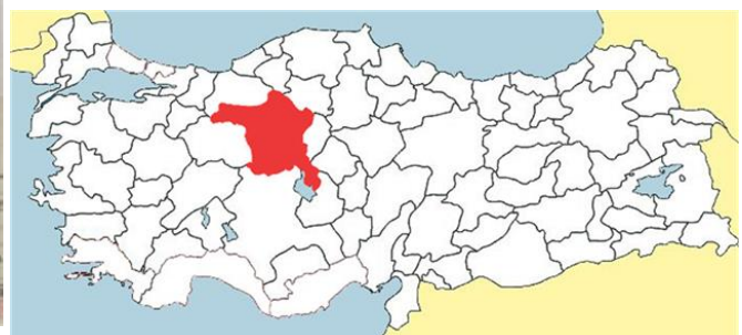
Figure 6. Distribution map