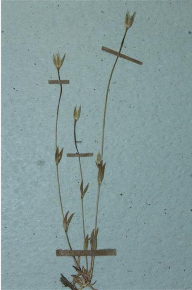
Figure 11. A Herbarium sheet