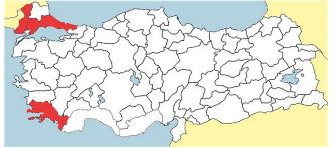
Figure 10. Distribution map

b. var. octandra (Ziz ex Mert. & W.D.J.Koch) M.Keskin stat. nov. [Fig.11, 12]