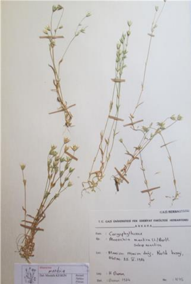
Figure 1. A Herbarium sheet

Yalova: Orhangazi yolu, 3 v 1950, A.Berk, T.Baytop (ISTE 2474!).