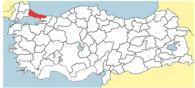
Figure 12. Distribution map

M. erecta is generally similar to the M. graeca . It is easily separated from the thickened pedicels, stamens with small numbers, and 4-part flowers. This species probably has a wider distribution in Turkey.