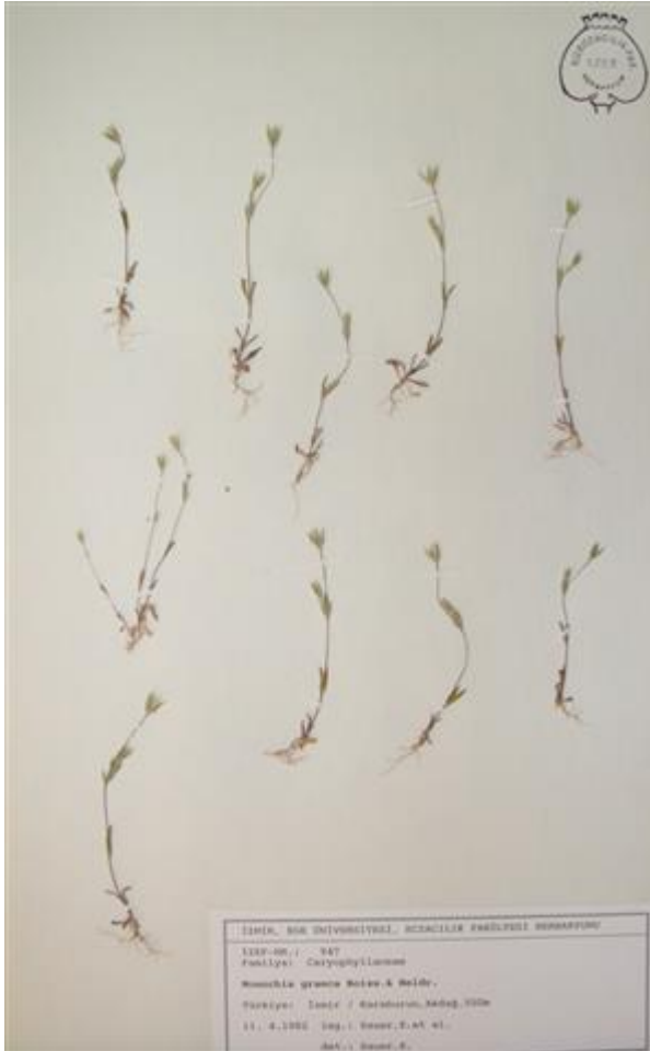
Figure 7. A Herbarium sheet