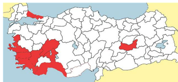
Figure 4. Distribution map

The most characteristic feature of the M. coerulea is the presence of blue to the purple corolla. This species is strictly related to M. mantica . But it is distinguished by the following characters: