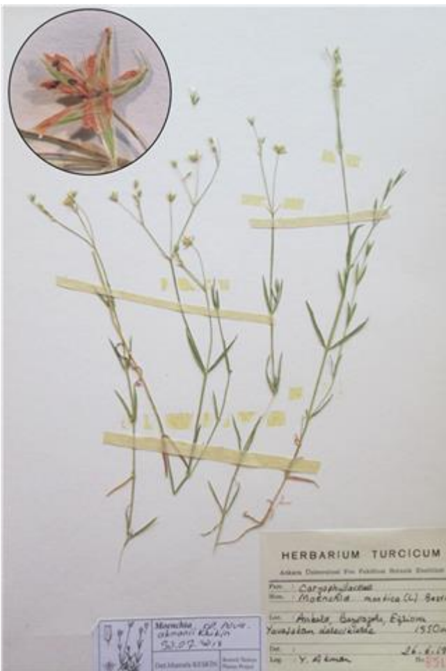
Figure 5. A Herbarium sheet (Holotype)

The proposed new species is strictly related to M. graeca . Differences are summarized in table 1. Nevertheless, the first impression as a general structure seems to be the M. mantica type, but it is easily separated from the corolla as sepal or short, linear leaves, etc.