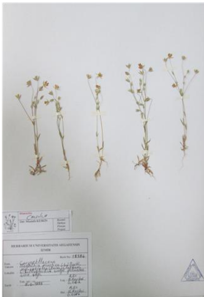
Figure 3. A Herbarium sheet