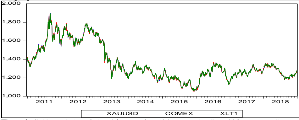
Figure 2: Gold spot (XAUUSD) and futures prices (COMEX and BIST gold futures-XLT1)

In our analysis, we use the daily return series of gold cash and derivatives markets in the Turkish capital markets from December 22, 2010 to December 31, 2018 (2093 observations). We obtain the price series of the gold futures contracts (XLT1) in the Borsa Istanbul Derivatives Markets from Bloomberg data vender. We also included Bloomberg gold spot market prices (XAUUSD) in the Borsa Istanbul Precious Metal Markets to the data set. We also obtain the gold index series of COMEX from Bloomberg. Figure 2 shows our data set for the BIST gold cash and derivatives markets and COMEX gold futures prices. Figure 2 clearly illustrates that the price series exhibit a tight co-movement for the sample period.