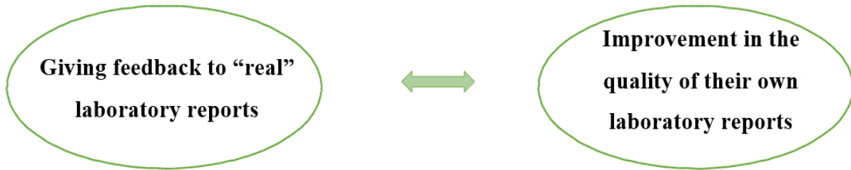
Figure 12. The interaction between giving feedback to student laboratory reports and improvement of laboratory reports

More importantly, through that process the participants should think about the learning objectives, the assessment criteria and assessment goals. In microteaching, they made clear to their peers (in micro-teaching) where secondary students were in relation to the intended outcomes, where they would need to go and how to get there (Wiliam, 2010). Thus, the feedback was focused on the task and learning targets and it was delivered in a way that was supportive and aligned with the learner's progress (Wiliam, 2010).