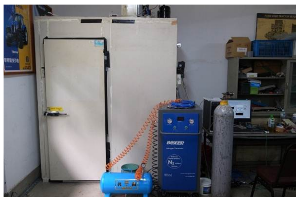
Figure 1. Controlled atmosphere storage chamber

The CA storage chamber (size 180X90X270cm) is shown in Figure 1 was used. Pressurized CO 2 and N 2 gas cylinders with separate flow meter were used to prepare the desired atmospheres. The gases and air were entered the CA storage chamber. Gas flow rates from the cylinders and air were adjusted by using a solenoid valve system to obtain the required gas concentrations. The excessive gas could be exhausted outside the CA storage chamber to prevent CO 2 accumulation and overpressure. The CO 2 and O 2 concentrations were checked by gas detectors and could also be recorded by a computer.