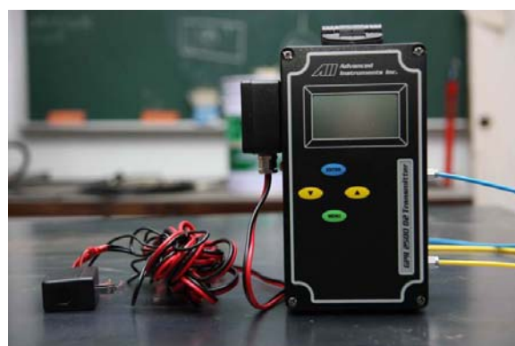
Figure 3. Oxygen transmitter (GPR-2500)