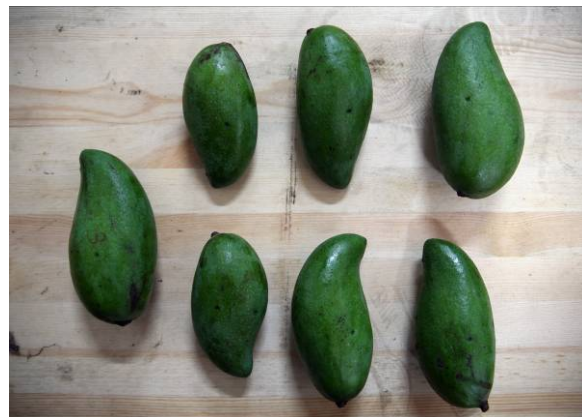
Figure 8. Control set (open air)

Fruits held at 6% O 2 and 4% CO 2 at 13°C showed a higher fruit firmness than the control set as shown in Table 1. Regarding the firmness, mangoes stored in CA represented the excellent results by retaining the maximum firmness as compared to air. The current