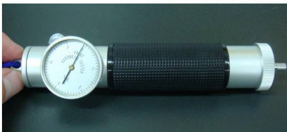
Figure 6. Fruit hardness tester (FHM-5)

Fruit firmness was measured in kilogram (kg) using a fruit hardness tester (Model FHM-5; Takemura Denki Manufacture Co., Tokyo, Japan) after the CA experiment as shown in Figure 6. The level of damage observed in each mango was evaluated from fruit firmness tester. Mangoes were randomly selected for evaluation with a fruit hardness tester. Flesh firmness was measured on the equator of the fruit. This portable fruit hardness tester was equipped with a conical measuring probe (12.3mm diameter).