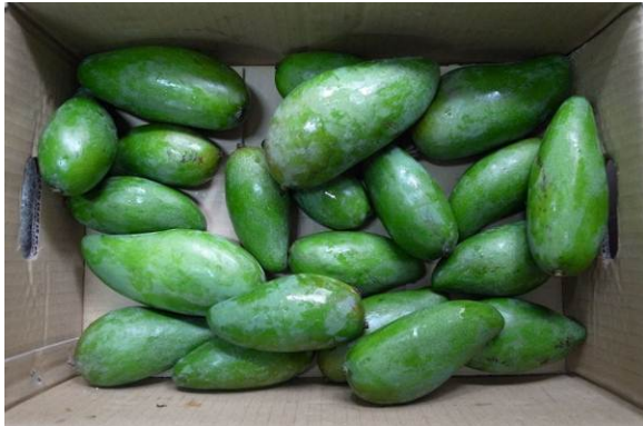
Figure 5. Mangoes ( Mangifera indica L.)

used in the experiment. All of the mangoes were stored at 13 °C with 80-90% relative humidity for one week, after which the mangoes were removed from the storage chamber and then analyzed by different quality parameters.