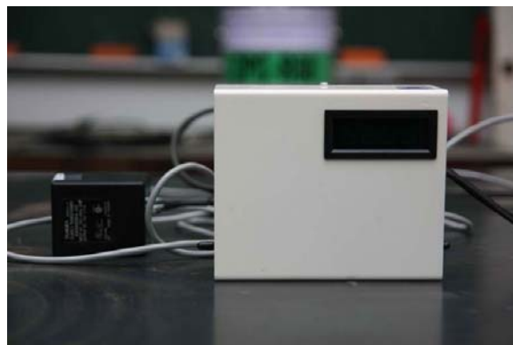
Figure 2. Carbon dioxide monitor/controller (M304)

Ethylene that released from the fruits was observed and decomposed with activated Potassium manganite (KMnO 4 ) in the CA storage chamber.