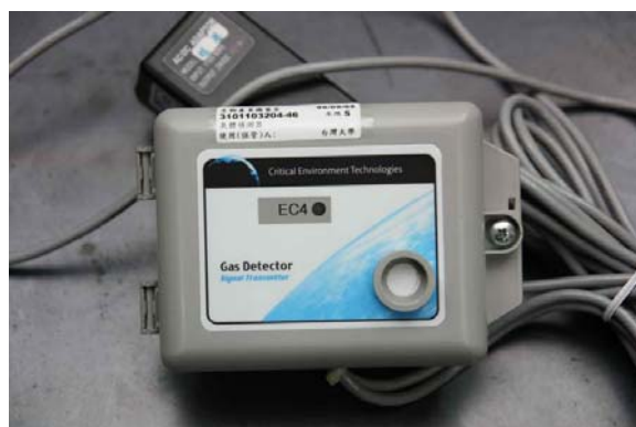
Figure 4. digital signal transmitter for Ethylene (AST-EC4)

Figure 5 shows the mango samples that were purchased directly from the orchard in Pingtung county, Taiwan. The mangoes were packed and transported to the laboratory within 24h after harvesting. Only sound and uniform mangoes were