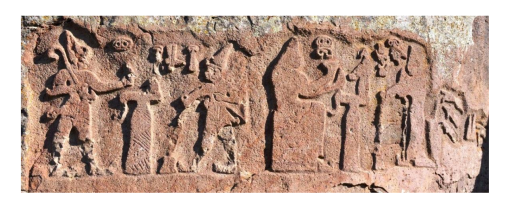
Fig. 4. Fraktin relief.