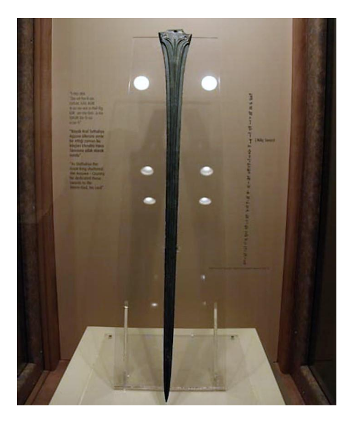
Fig. 3. Sword of Tutḫalia I/II (Çorum Archaeological Museum)