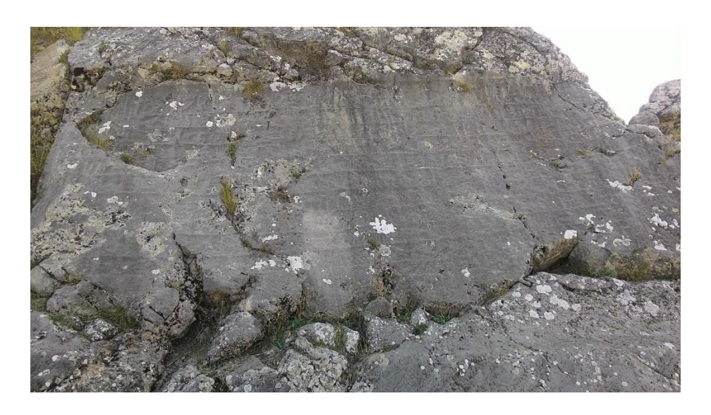
Fig. 8. Nişantaş Inscription.