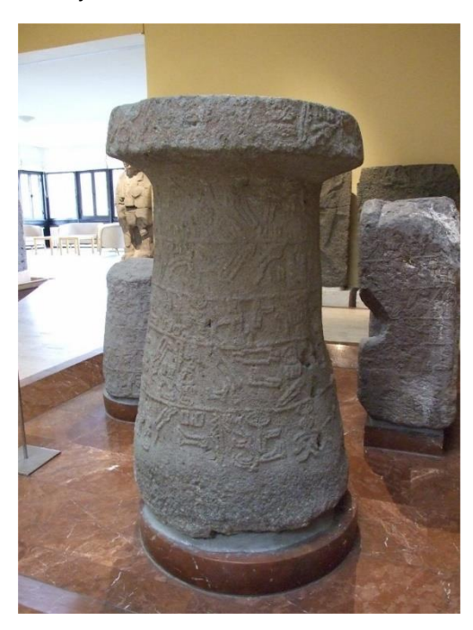
Fig. 6. Emirgazi altars.

ERÜSOSBİLDER XLVIII, 2020/1 CC: BY-NC-ND 4.0