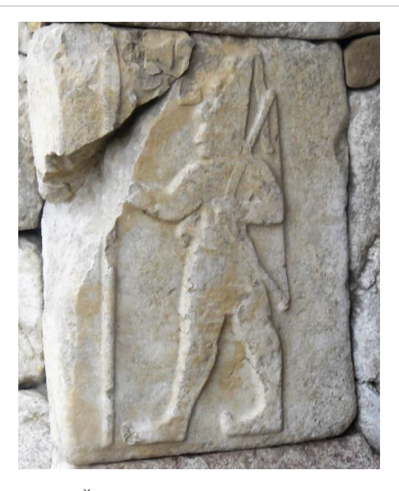
Fig. 7. Šuppiluliuma relief on southcastle.