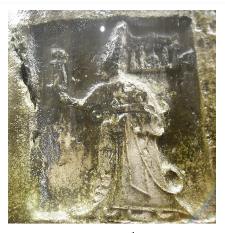
Fig. 5. Yazılıkaya B room. Relief of Šarruma and Tuthalia IV