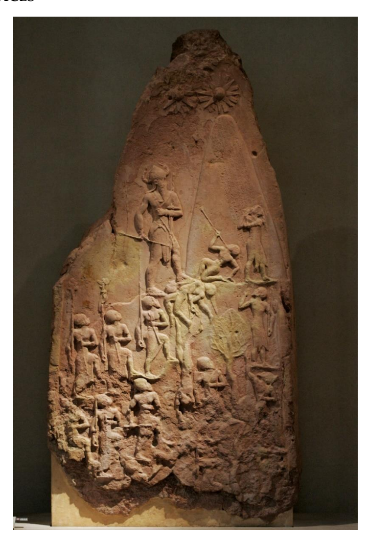
Fig. 1. Victory Stele of Naram-Sin. (Collon, 1995, p. 75)