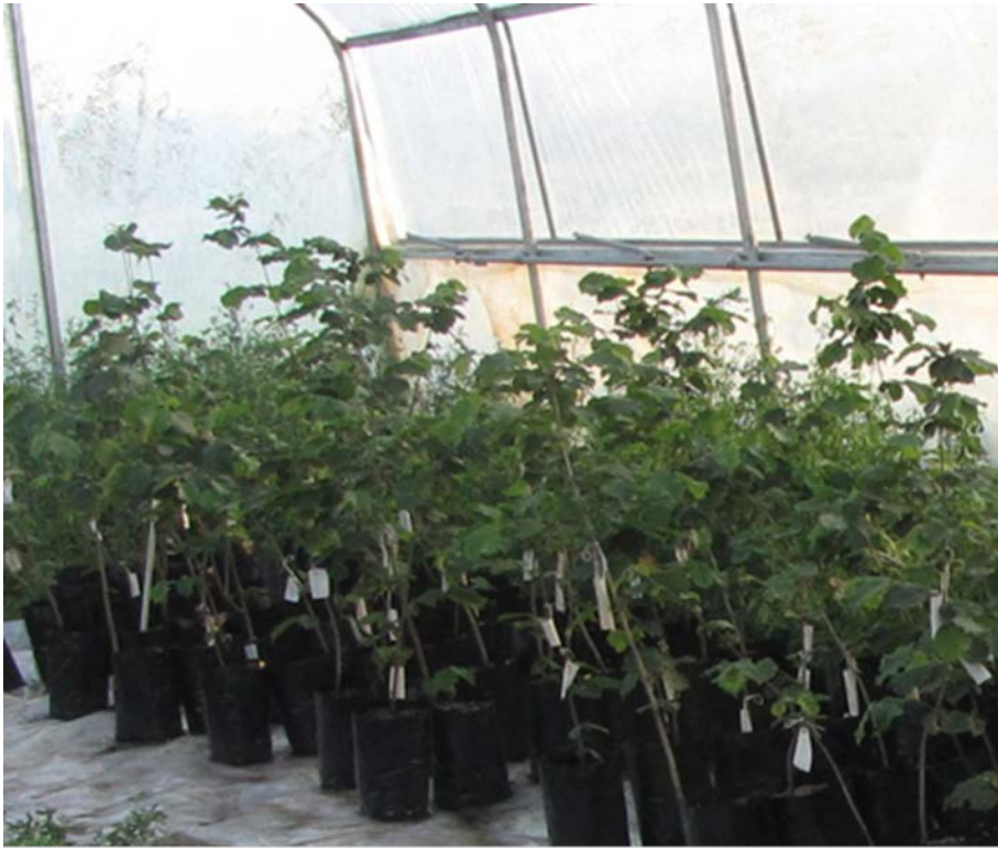
Figure 1. Appearance of hazelnut saplings before bacterial infection.

Şekil 1. Bakteriyel enfeksiyondan önce fındık fidanlarının görünümü.