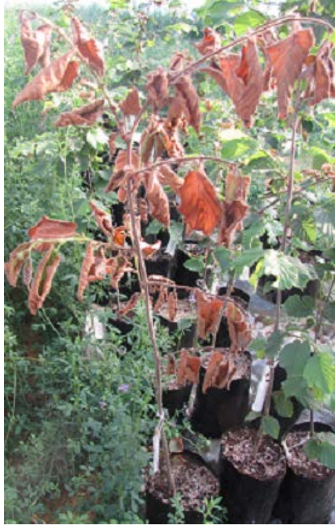
Figure 2. Appearance of Yassı Badem sapling infected with X. arboricola pv. corylina .

The results from both of the evaluations (total infected leaf percentage and infected leaf area) suggested that Yassı Badem cultivar was the most susceptible and İncekara the most resistant to the pathogen. Figure 2 shows Yassı Badem sapling infected with the pathogen.