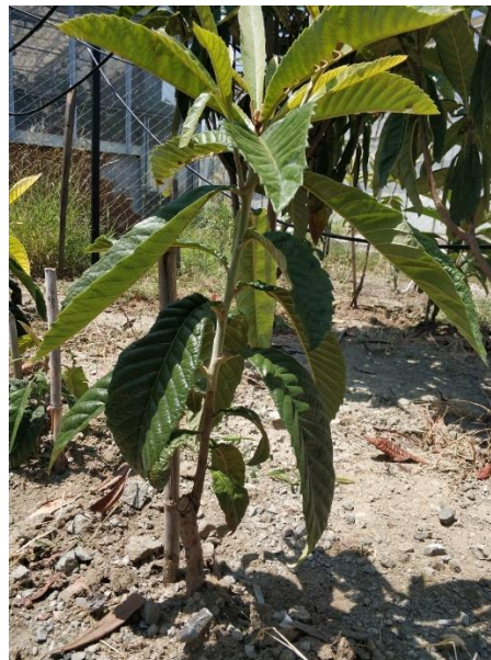
Figure 4. A loquat sapling on hawthorn rootstock.

It can be concluded that hawthorn which tolerates many environmental stresses such as drought and unfavorable soil conditions, can be used as a promising rootstock for loquat production either as a dwarfing rootstock for high density orchard plantation, or as a drought resistant rootstock for being exploited against ongoing drought condition nowadays all-over the world. Preliminary results of this study show that hawthorn rootstock can be used in loquat cultivation (Figure 4).