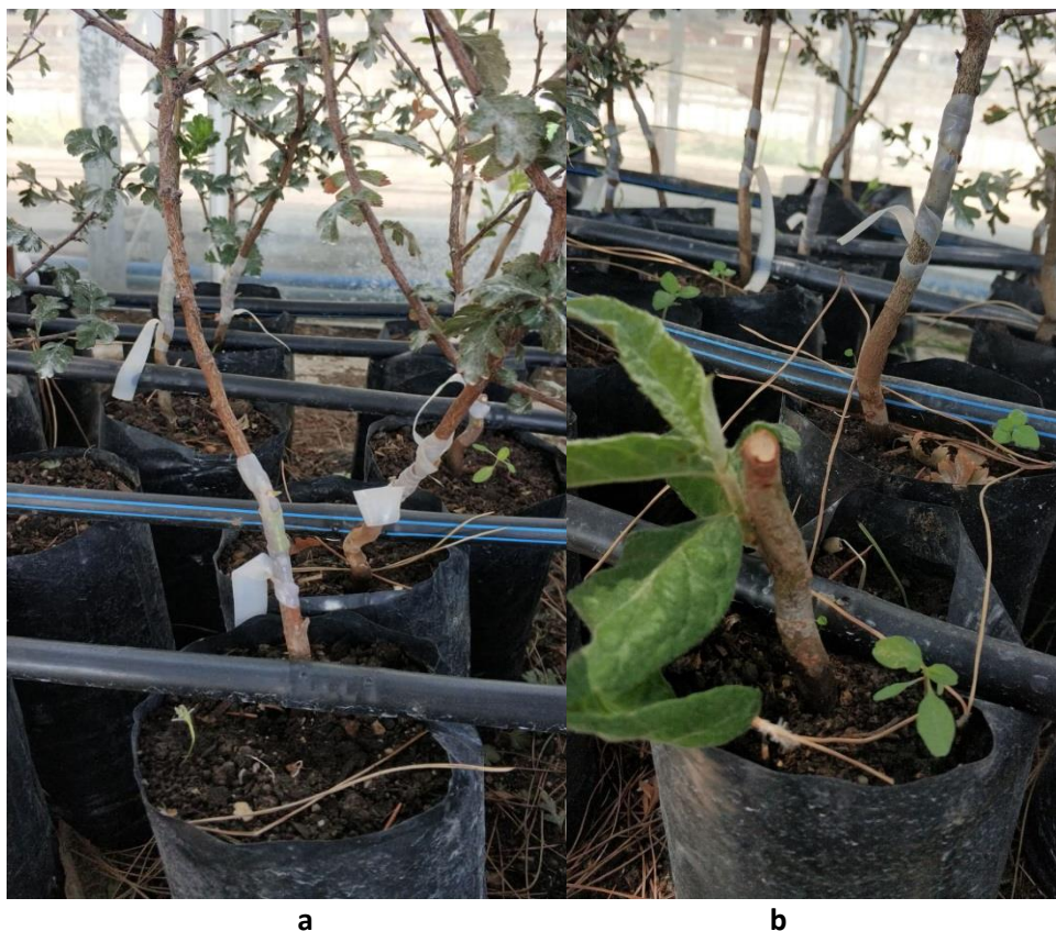
Figure 1. a: Budding of hawthorn rootstocks with Hafif Çukurgöbek loquat cultivar and b: Cutting from 10 cm above the budding point.