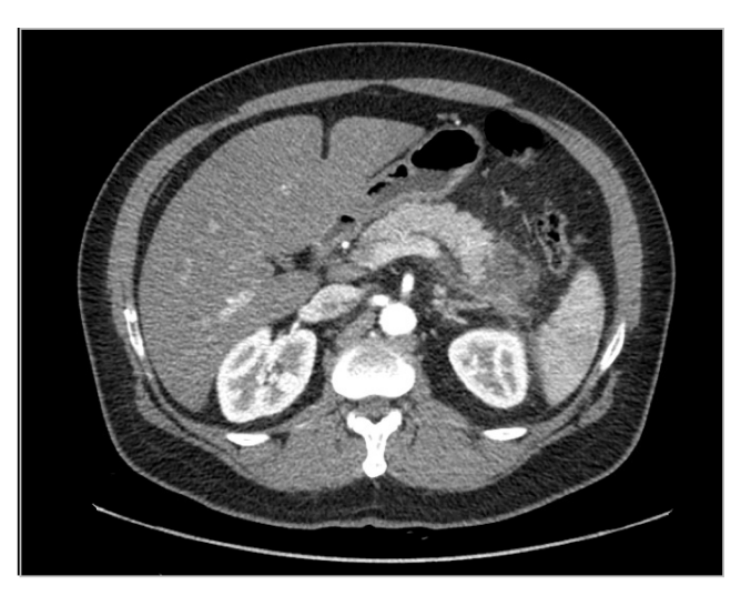
Figure 2: CT Abdomen with IV Contrast

inducing properties. He was seen for follow up in the endocrinology clinic and he was doing well with no further complications.