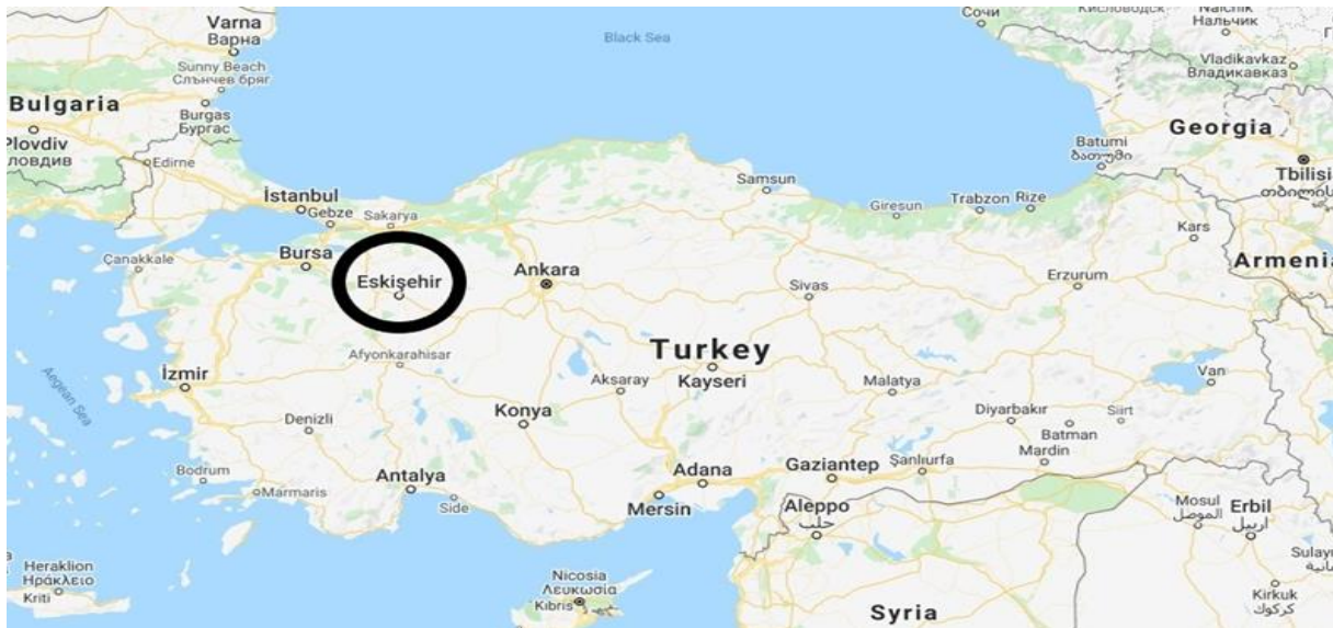
Figure 1. Location of Turkey and Eskisehir province (with black circles).

This study was carried out between June-July 2020 in Eskisehir (Figure 1). Based on the traces and signs of red deer in the Catacik region of Eskisehir, 32 fresh fecal samples belonging to animals from the places where the faeces density was found were taken into transparent nylon bags and recorded by numbering. The faeces obtained were brought to laboratory.