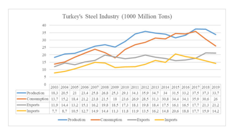
Figure 2. Turkey's Steel Industry-Overview

In Turkey, steel production has risen from 18,3 million tons in 2003 to reach its peak in 2017 with 37.5 million tons and then decreased to 33,7 million tons in 2019. As a result of rising global protectionism measures, trade diversion effects, EU quota practices and demand contraction in domestic and foreign markets, Turkey's steel production has decreased by 9.6 percent in 2019 compared to 2018 (Figure 2) (Turkish Steel Exporters' Association, 2020).