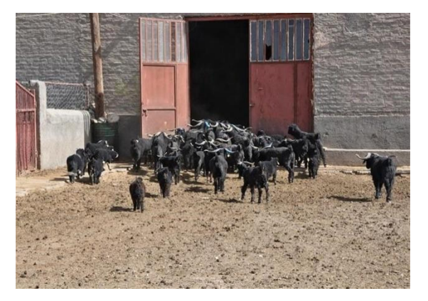
Figure 8. Sample view of Cashmere Goat Breeding Research Station (By author, autumn 2019).

Visiting of author from Jihad- Agriculture Organization near the city of Sarbisheh and its Cashmere Goat Breeding Research Station that is located in the 15 km distance to city of Sarbisheh, - and near boundary regions with Afghanistan - 90 km east of Brjand, center of South Khorasan Province, east of Iran. This Cashmere Goat Breeding Research Station established in 1998 and presently has 182 mature cashmere goats for research goals and preserving and breeding them (Figure 8).