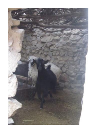
Figure 1. Goats and sheep breeding all together in many rural areas of Iran.

information is collected by interview in case of availability of the holders of goats and sheep, otherwise, by interview with the local informants. Also the data of goat number, goat milk, meat and raw skins etc. in the different continents and countries were taken from the FAO data base, Jihad Agriculture Organization of Iran, National Bureau Statistics of Iran etc. These data are processed statistically and analyzed further in order to arrive in appropriate conclusions. Also author utilized scientific journals and sites, his experiences. observations, interviews, pictures etc. that gathered them during two decade work and visiting rural and nomadic regions in various parts of Iran, specially in main locations of research namely South Khorasan province, east of Iran and Chaharmahal and Bakhtiari Province and its situation in south west of Iran (Figure 2).