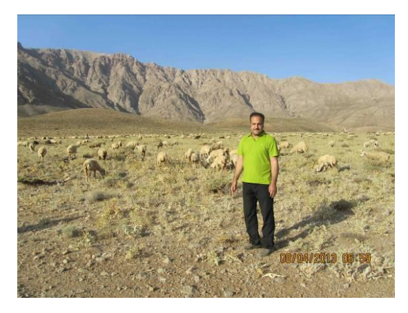
Figure 6. Pasture for goat and sheep raising together (August 2, 2013).

During research in Gol village (50 km distance from Birjand, centre of South Khorasan province). As observe in these field research pictures, small and peasantry farmers raising goats and sheep all together in their rural homes plus horticulture, farming etc. (Figure 7).