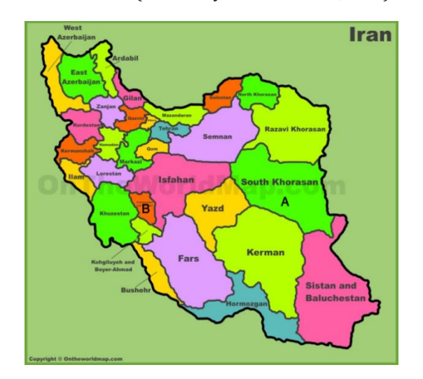
Figure 2. Map of main locations of research namely South Khorasan province, east of Iran (A) and Chaharmahal and Bakhtiari Province in south west of Iran (B).

Figure 1. Goats and sheep breeding all together in many rural areas of Iran (Pictures by author. Autumn, 2017).