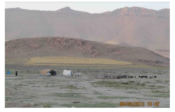
Figure 5. Destruction and pressure on pastures.

During the research in a nomadic region – as a main source of overgrazing and destruction and pressure to pastures by their goats and sheep herds etc.- in lake Choghakhor near (7 km) city of Boldaji and near lake Choghakhor, Chaharmahal and Bakhtiari Province, south west of Iran. Plus changing pasture lands toward agricultural lands during three past decades in mountains and field of this lake by nomadic and rural people (Figure 5-6).