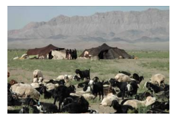
Figure 3. Nomadic goat raising.

The nomad livestock were not fed in stables or in restricted areas, but moved and grazed freely in extensive open grazing areas. Nomad families used the northern highland rangelands in spring and summer for grazing and migrated to the warmer southern Persian Gulf provinces in autumn and winter (Figure 3).