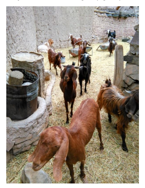
Figure 7. Goat raising in Gol village (Spring 2015).

During research in Gol village (50 km distance from Birjand, centre of South Khorasan province). As observe in these field research pictures, small and peasantry farmers raising goats and sheep all together in their rural homes plus horticulture, farming etc. (Figure 7).