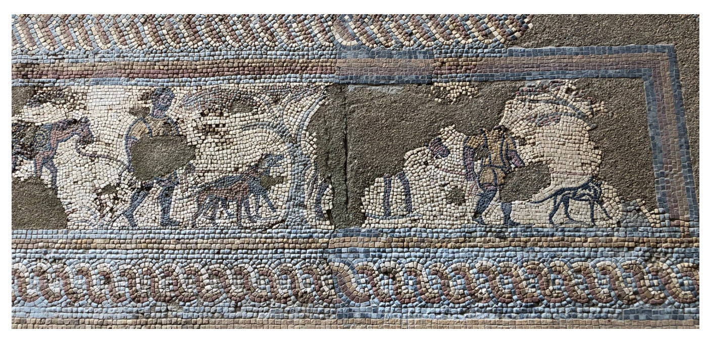
Figure 6 Mosaic of the hunting scene of the "Room of the Auriga" attached to the œcus-triclinium. House of the Fountains, Conímbriga.

Another type of hunting that may be designated as "domestic" hunting, sometimes practiced with nets to capture animals, also decorates several late mosaics, among which it is possible to mention the "Hare Hunt" mosaic of El-Djem; the "Little Hunt" mosaic of "Maison des Laberii", at Oudna (Dunbabin 1978 pl. XI fig. 22; pl. XXXIX fig. 101); some of the panels at Villa del Casale, in Piazza Armerina; or the mosaic of a room attached to the æcus-triclinium of the House of the Fountains at Conímbriga, dated from the last quarter of the 2nd century – first quarter of the 3rd century (Corpus Portugal I: 117-125 nº 11 est. 45-46)<sup>5</sup> (Fig. 6); These representations of hunting scenes, usually practiced at the great Villae, belong to a different conception of hunt, in which the dominus participate, occupying their otium cum dignitate<sup>6</sup>.