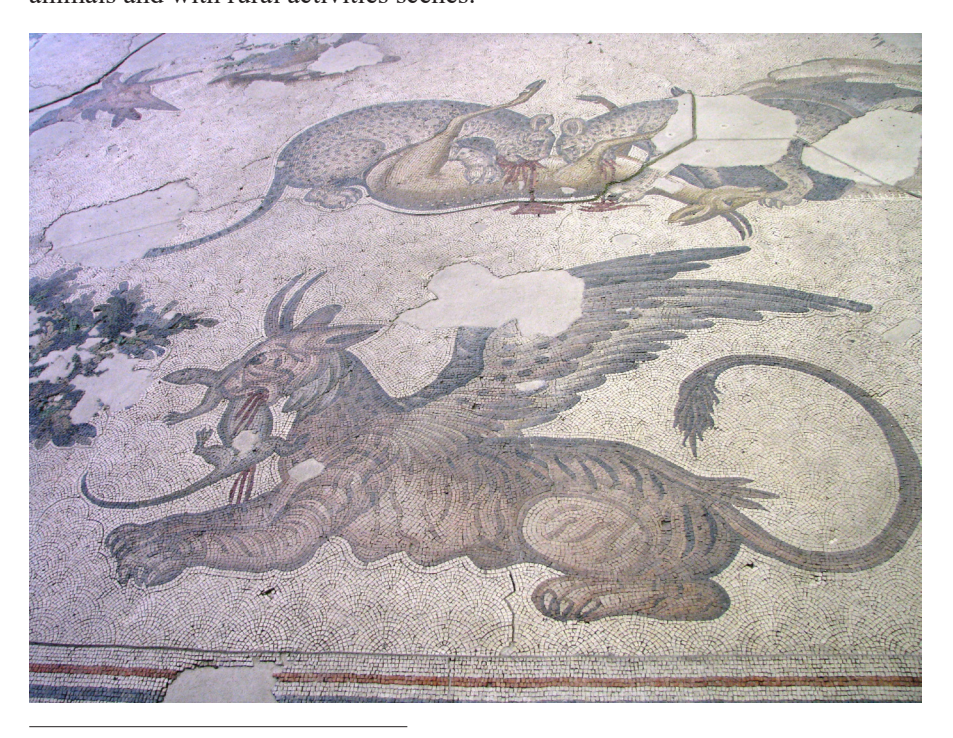
Figure 4 Mosaic of the Great Palace at Constantinople.

Due to the fact that we only have a fragment of mosaic, we do not know: if this scene was part of an extended composition of a "hunting scene", with the representation of other animals and humans; if it was isolated in the mosaic decoration set; or if it was represented alongside other scenes of a different nature, such as the mosaic of the Great Palace at Constantinople (part of the collection of the Archaeological Museum in Istanbul) (Fig. 4), in which scenes of predation between real animals coexist with fight scenes between fantastic animals and with rural activities scenes.