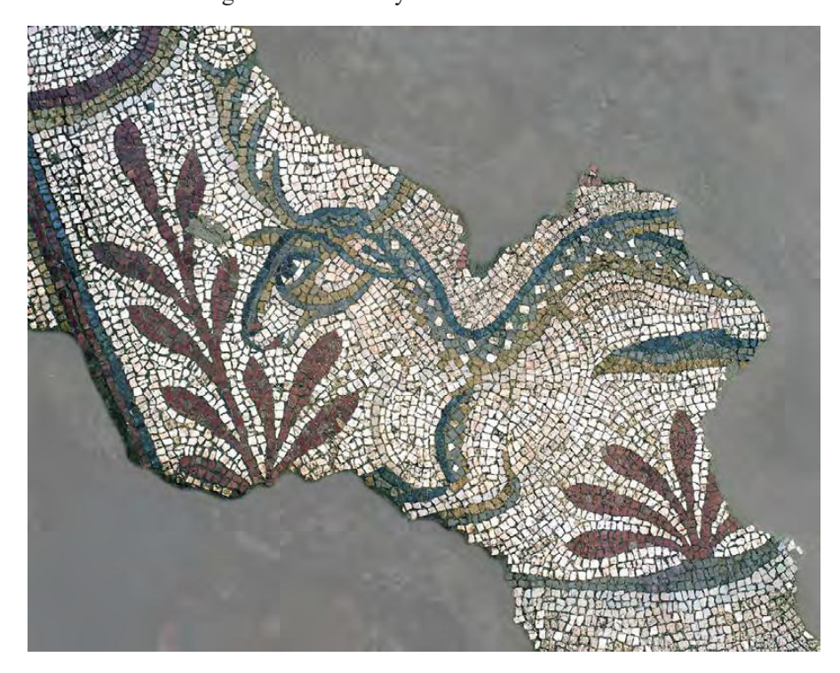
Figure 7 Representation of a deer. Mértola, Portugal.

In Portugal, we can see on the mosaic of the "hunting scene" of Mértola (Lopes 2003: 102-104 fig. 69) (Fig. 7), from the Byzantine period, similarities with the animals of the mosaic fragment donated to the MDDS, particularly regarding the design of the back of the deer with white and black tesserae and the filling of the body with the tesserae arranged in curved lines, reminding the opus vermiculatum . These aspects will be another contribution to attest to the late execution of the fragment under analysis.