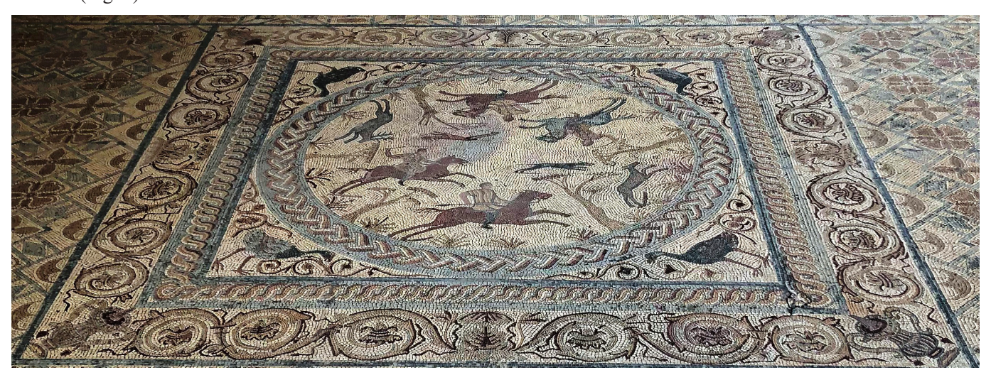
Figure 5 Mosaic of a deer and doe-hunting scene. House of the Fountains, Conímbriga.

The representations of large hunting scenes of ferocious animals, in which hunters fight with animals on horseback or in close combat, or the animals fight among themselves, can be seen on late mosaics from Eastern and Western Roman Provinces. As a few examples, we can point to the mosaic of Apamea (Mosaic of the Great Hunt at the Governor's Palace, of the late 4th century, in exhibition at the Museum of the Cinquentenary Park in Brussels) (Balty 1995: 354 pl. XXII fig. 1); the mosaic at Carthage, Maison des Chevaux, from the early years of the 4th century in which the theme is affected by the venationes of amphitheatre (Dunbabin 1978: 53 pl. XII figs. 24-25); some 4th century panels (Great Hunt) of the Villa del Casale, in Piazza Armerina, Sicily; on Hispanic mosaics, also from the 4th century, as the mosaic from the œcus of the Villa de La Olmeda (Pedrosa de La Veja, Palencia) (Guardia Pons 1992: 149-156). These examples are depictions of bloody hunts, with scenes of fights between humans and animals. These were authentic battles that in real life could occupy the otium of the Roman elites, among them the military, serving as physical and mental preparation for wars.