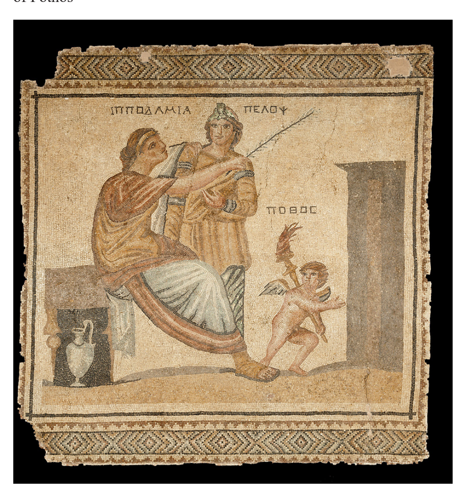
Figure 1 Marriage of Hippodamia and Pelops ( Opus tessellatum - stone tesserae , including marble, and glass) (H. 201 cm/W. 209 cm).