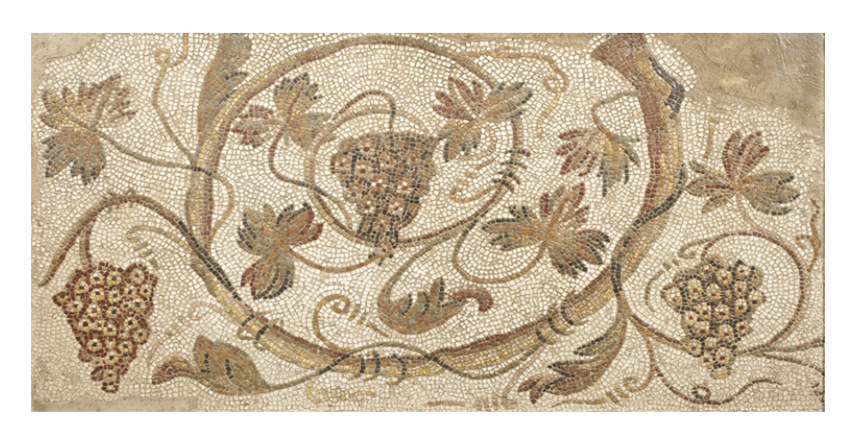
Figure 8 Mosaic with a vine-scroll: bunches of grapes, vine leaves and tendrils. (H.75.5 cm/W. 138 cm).

The coppery vine trellis represents autumn and the big bunches display bright berries. The detail of the drawing in which the tessellatum suggests the work vermiculatum , with the vine leaves in frontal and lateral perspectives, the berries with a white tessera in the centre, providing them with volume, and the tendrils that subtly wrap themselves around the trunk are features that point to a mosaic workshop of excellent quality.