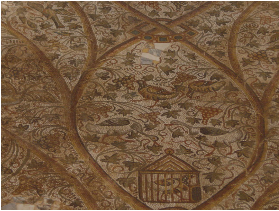
Figure 10 Mosaic of Pedras d'El-Rei, Luz de Tavira (Portugal).