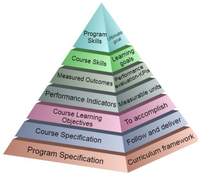
Figure 3. The bottom-up approach and associated entities of an academic course in higher education.

Effective implementation of the suggested actions assures quality improvement in the course delivery and learning.