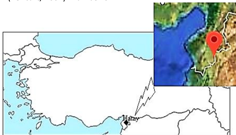
Figure 1. Sampling site of Leptodemus minutus

The study material was constituted from specimens of L. minutus which collected from Hatay in 2019 (Fig. 1). The material was obtained from cotton. In this study, specimens were prepared for re-description for species level, the body parts of examined species having taxonomical importance were photographed. In addition, distributional data of the species in Turkey and on the world, host plants and collection locality information for each of the species investigated were given. Important morphological characters of species were examined. The specimens were dissected for examination, and abdomens were removed and placed in a cold 10% KOH solution for 10 minutes. Then the important terminal parts showing taxonomic characters of the species were removed from the abdomen. Photos enhanced using Corel PHOTO-PAINT software (version 12.0). Morphological characters given in this paper are according to Çağatay (1985). The material deposited in the Nazife Tuatay Plant Protection Museum (Ankara).