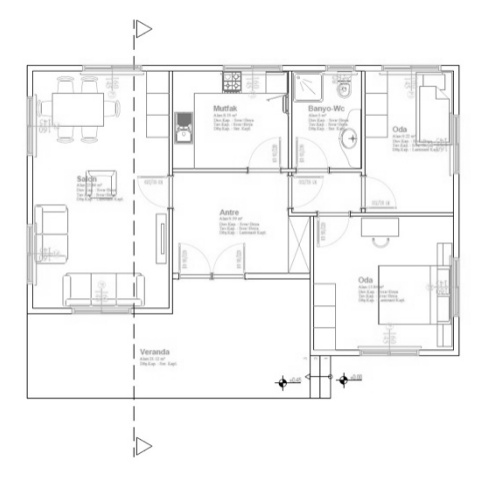
Figure 1. Draft of given .dwg plan

Basic commands in the interface of Revit Architecture were delivered to the students and their practices were completed by week eight. In the 8th week, the students were given a three-hour-quiz where they were required to model the given project from base to roof. They were also given the flexibility to use advanced commands if they managed to add furniture and other materials.