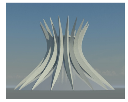
Figure 3. The Cathedral of Brasilia by Oscar Niemeyer, BIM modelling (Student 23)

design solutions. Student 23 in 4th grade at graduation project level managed to model the centralized and rising form of The Cathedral of Brasilia by architect Oscar Niemeyer with additional studies (Figure 3).